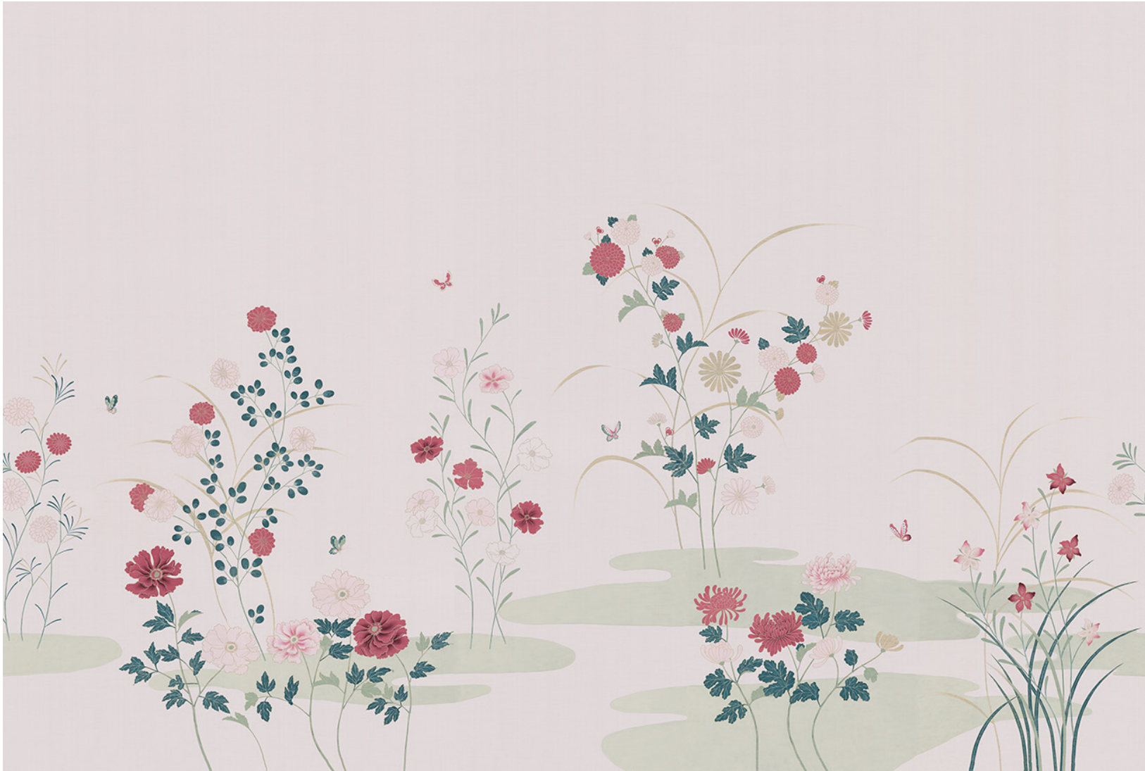
01 Celadon Rose