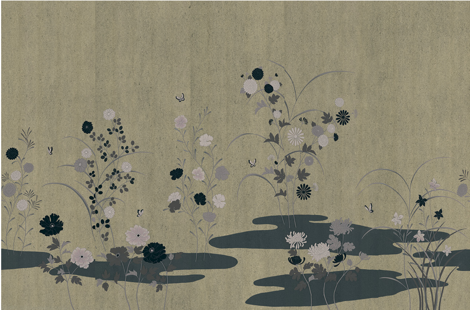
03 Ebony Frost