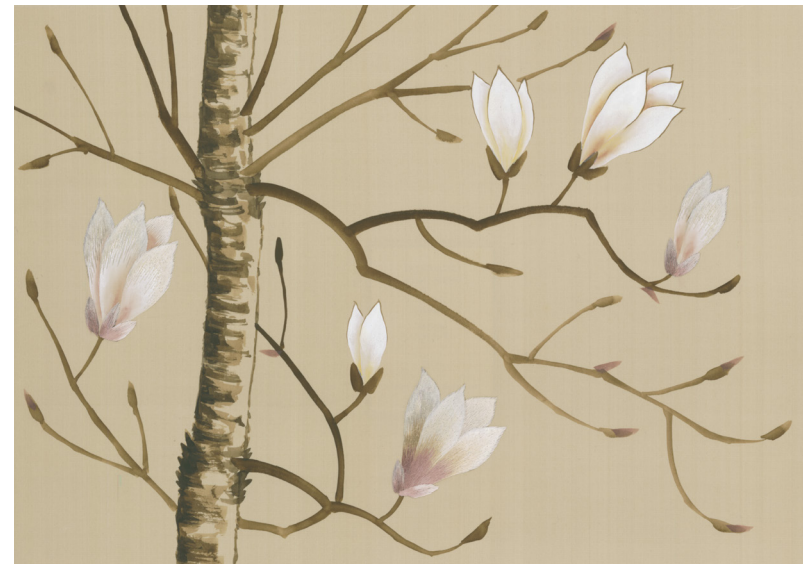
03 Shell Pink on Platinum Silk