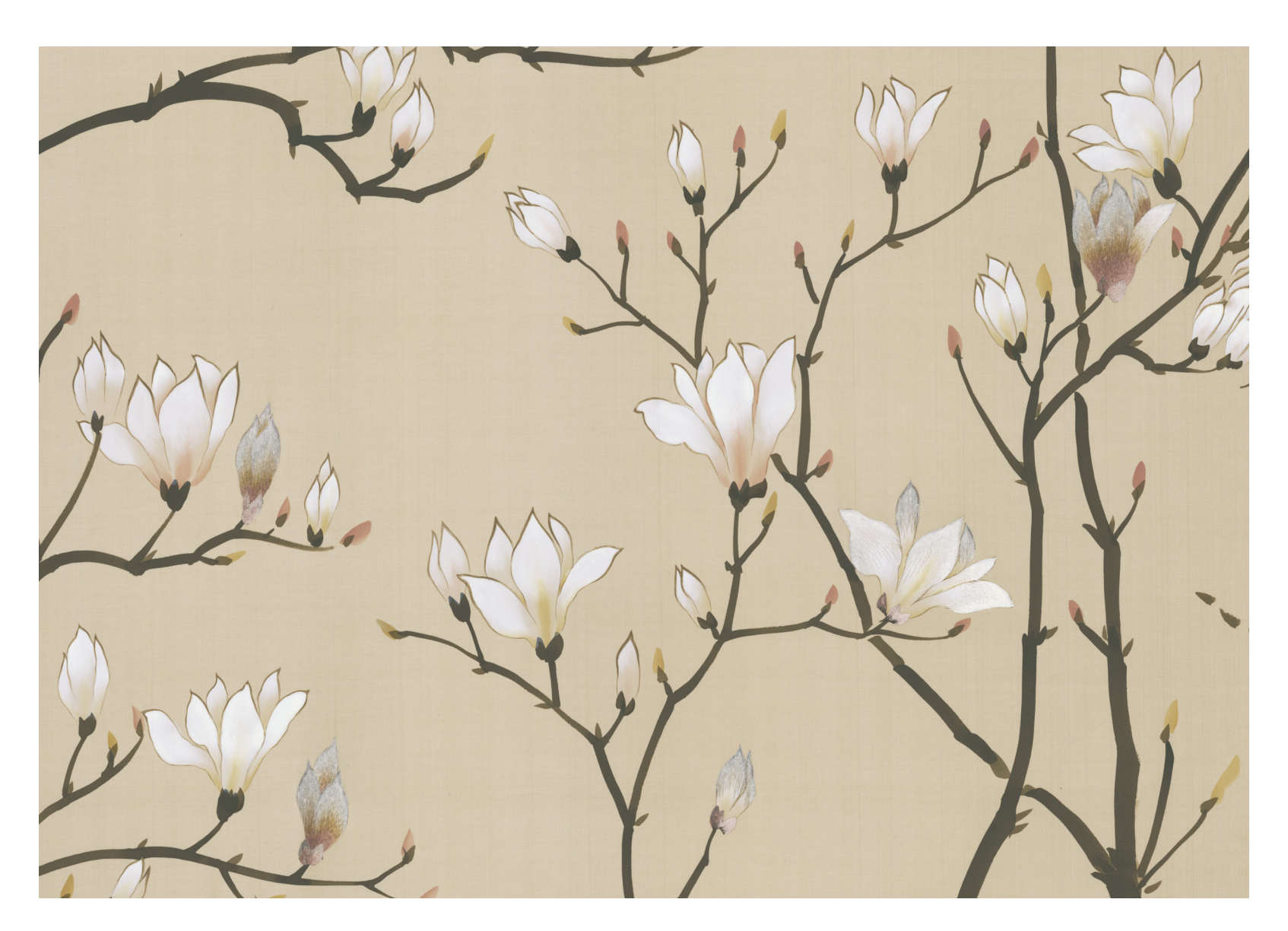
Magnolia in Shell Pink