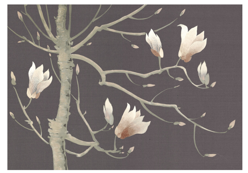
01 Smoked Pearl on Graphite Silk