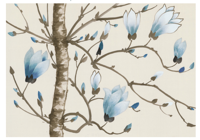
05 Arona on White Silk