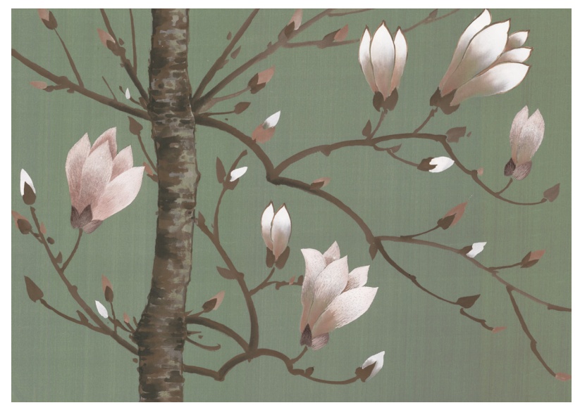
06 Tourmaline on Elephant Silk