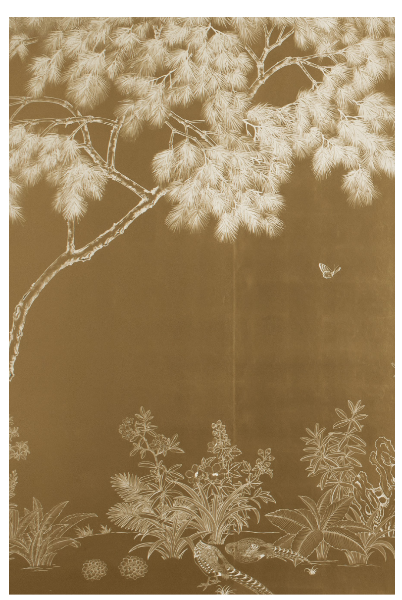
02a Berry on Hand-gilded Paper