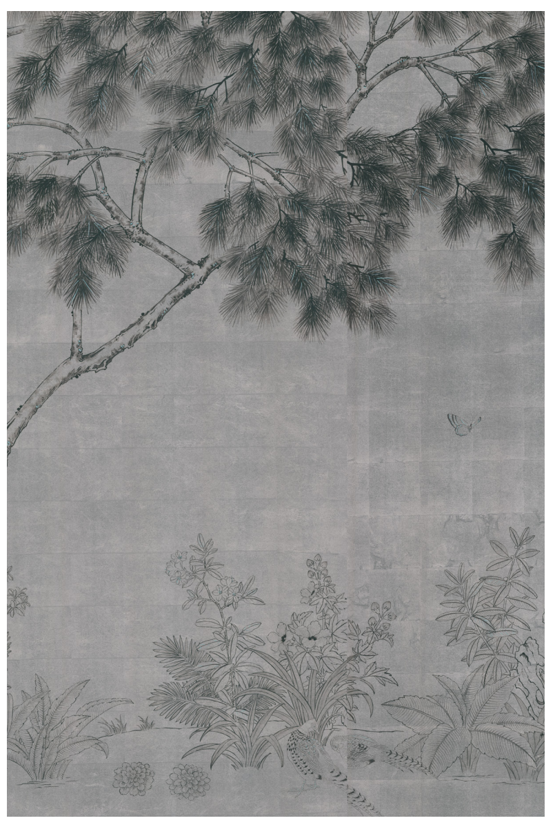
01a Shen on Hand-gilded Paper