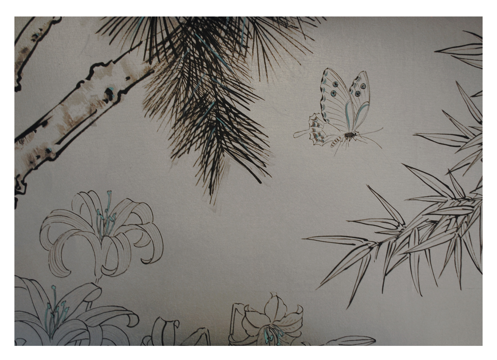
Garden of Hours in Shen