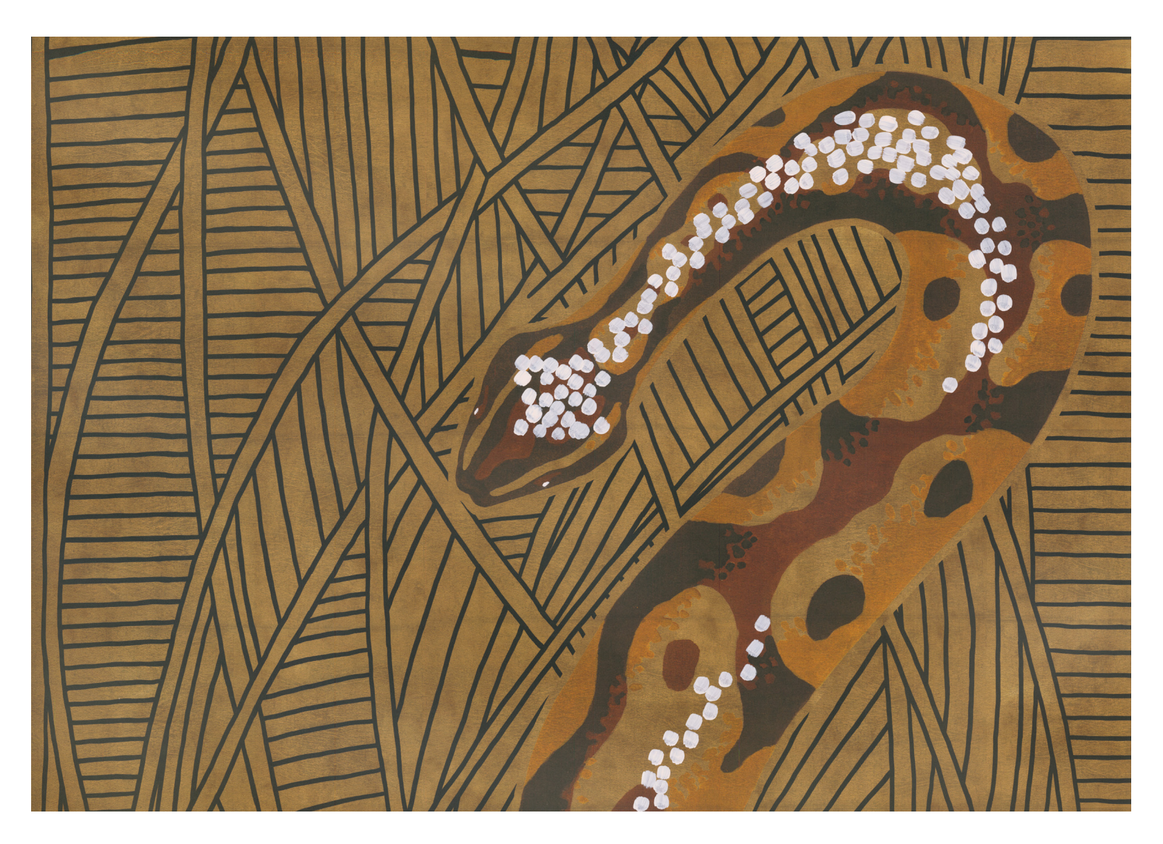
Les Boas in Savanna