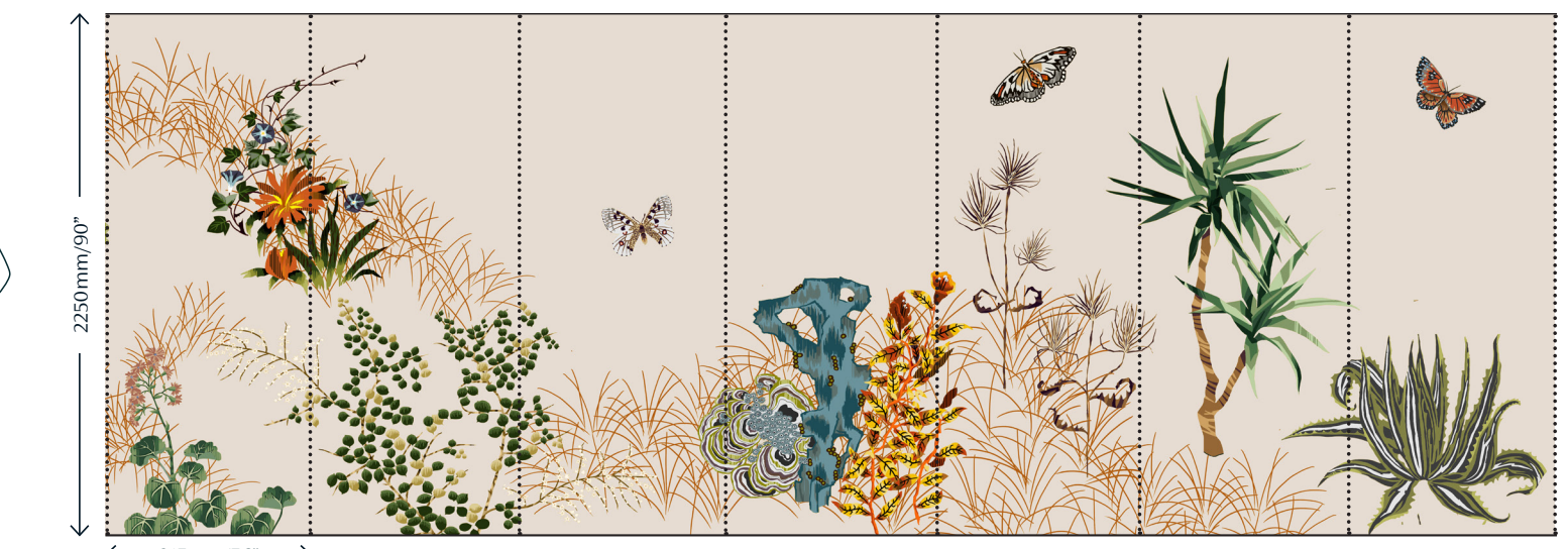
\longleftarrow \text{ 915mm/36"} \longrightarrow