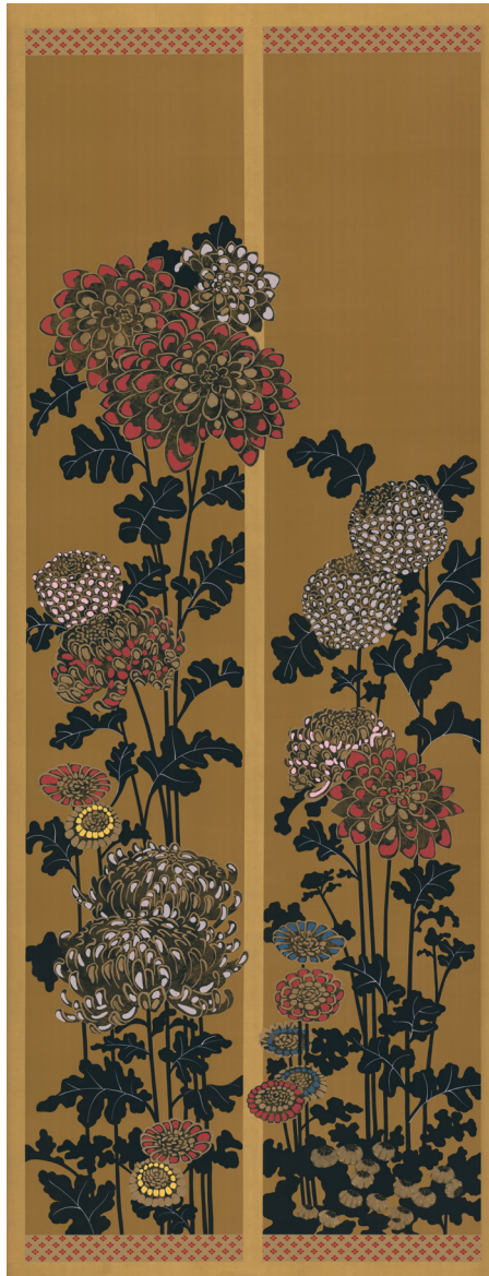
01 Edo on Bronze Silk