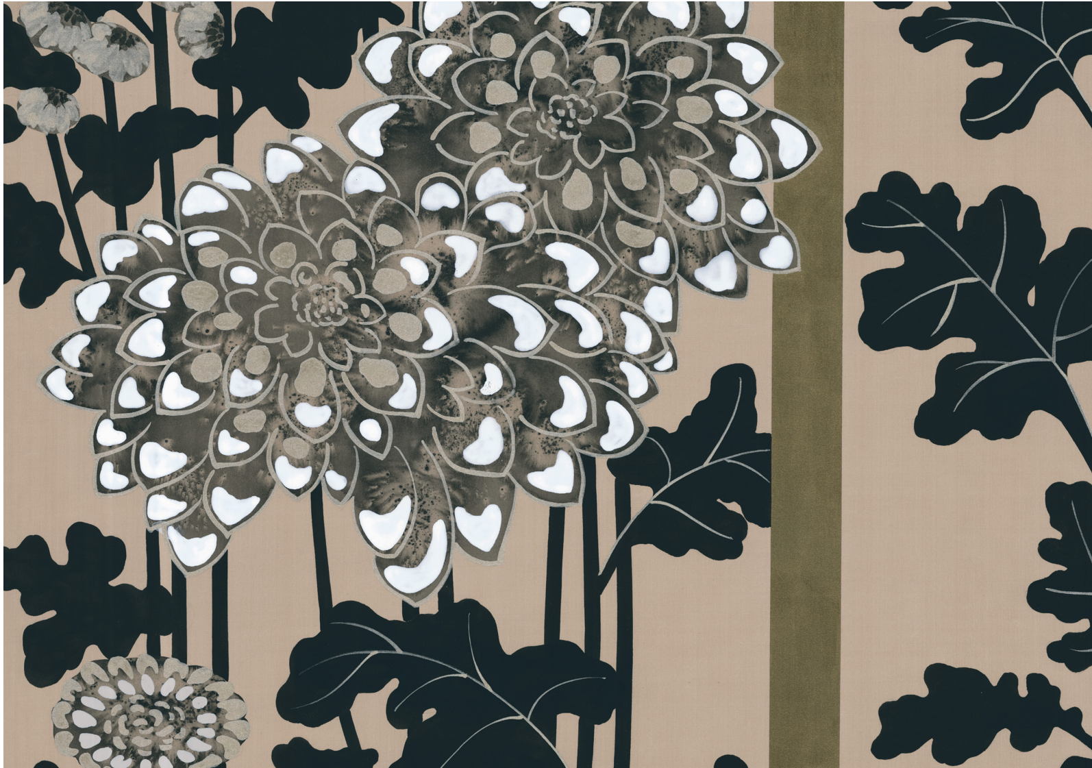
Kiku in Shiori