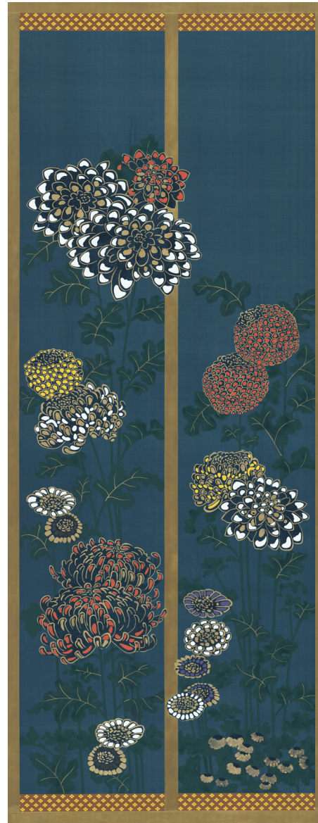
03 Iki on Delon Silk