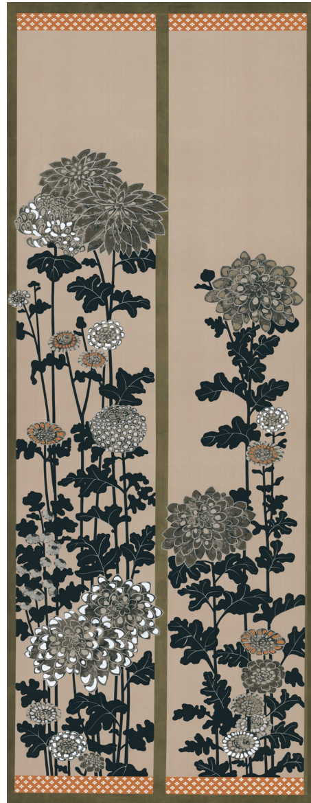
02 Shiori on Pebble Silk