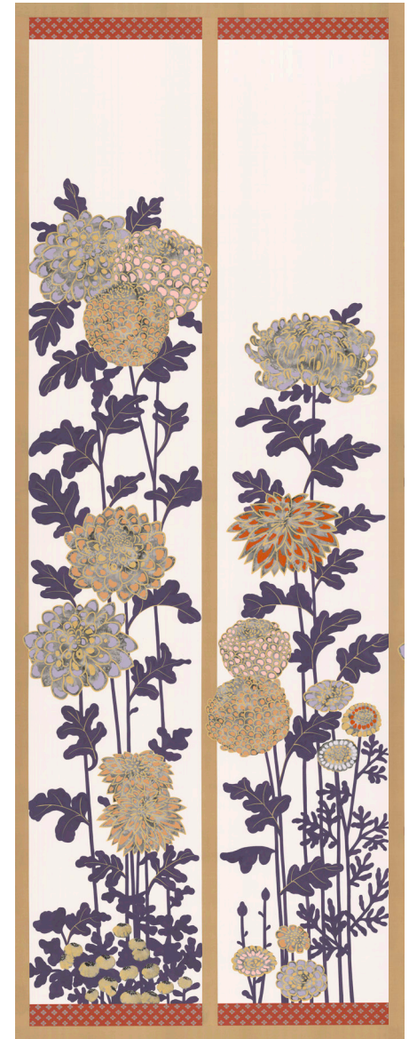
04 Meiji on White Silk