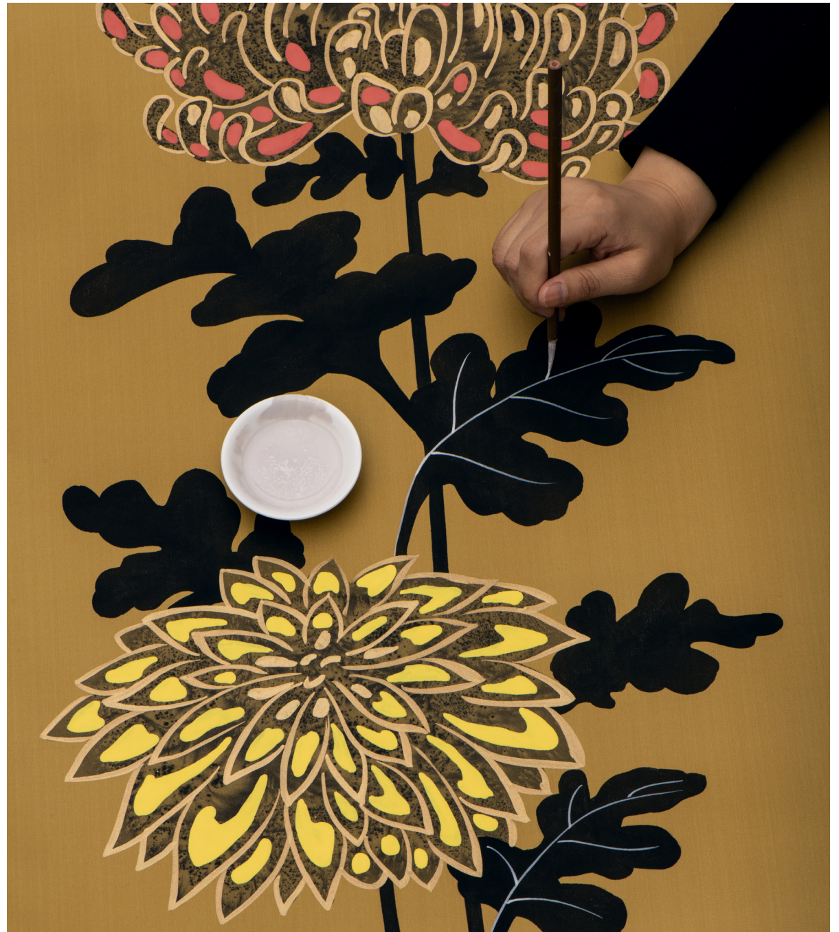
RIGHT-HAND IMAGE Close-up of Kiku in Edo

Combining hand-painting and screen-printed details to create this highly decorative wallcovering.