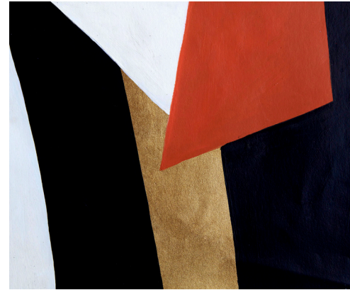
04 Ouro on Hand-Gilded Paper