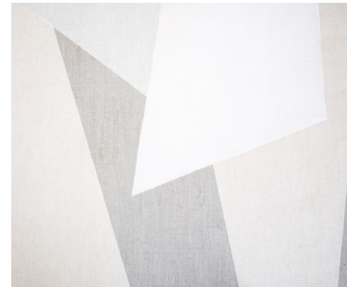
08 Branco on Hand-Brushed Linen