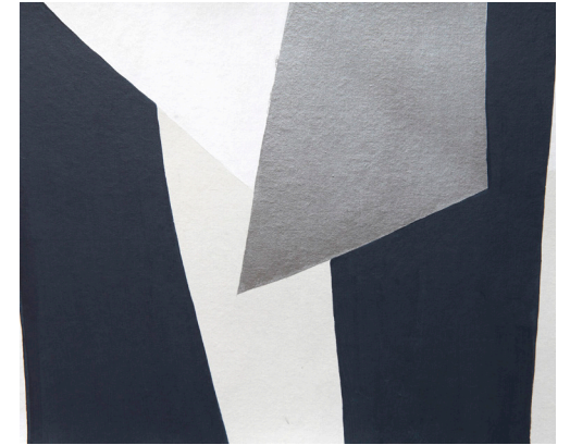
05 Preto on Hand-Brushed Papyrus Paper