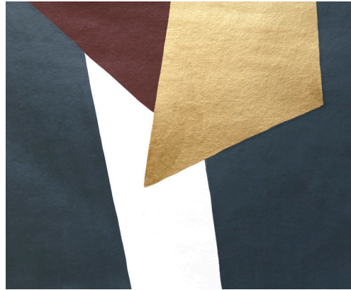
03 Cinza on Hand-Brushed Papyrus Paper