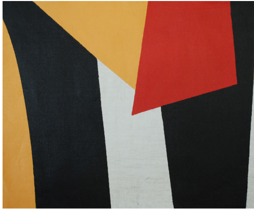
01 Gilberto on Hand-Brushed Linen