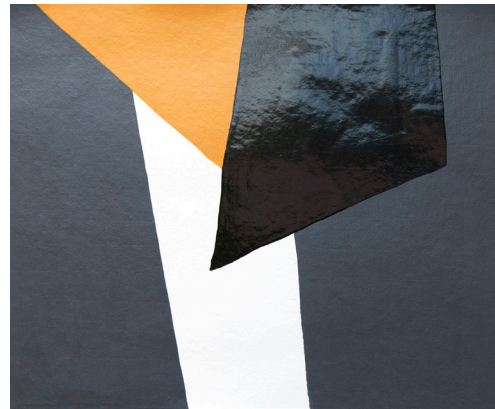
07 Amarelo on Hand-Brushed Papyrus Paper