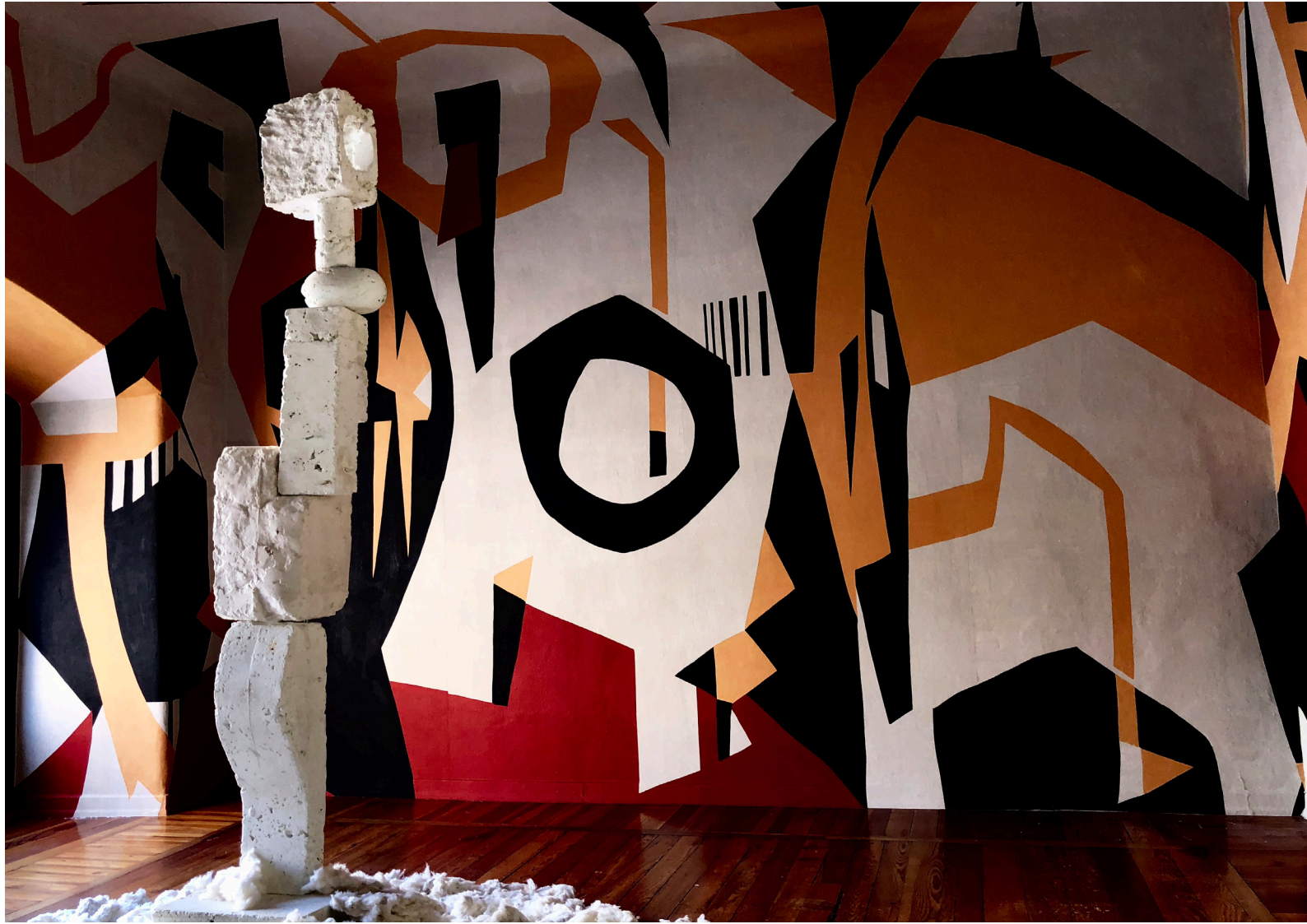
Raw in Gilberto