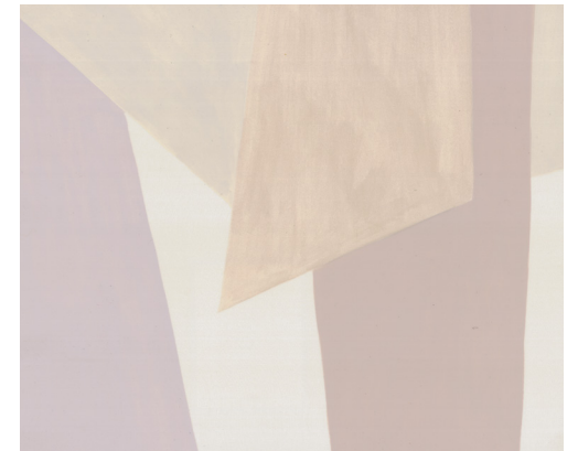
09 Ether on White Silk