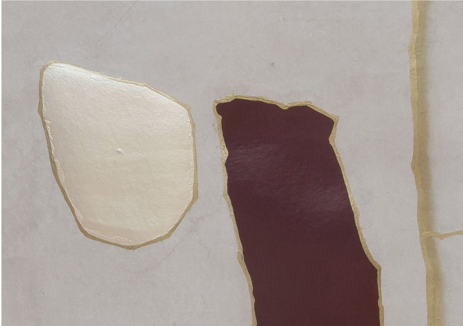
Rexine in Roan