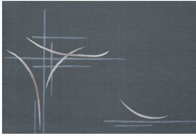
02 Frutiger on Dusk Faille