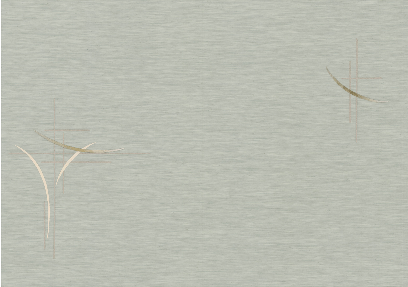
Miedinger on Breeze Faille