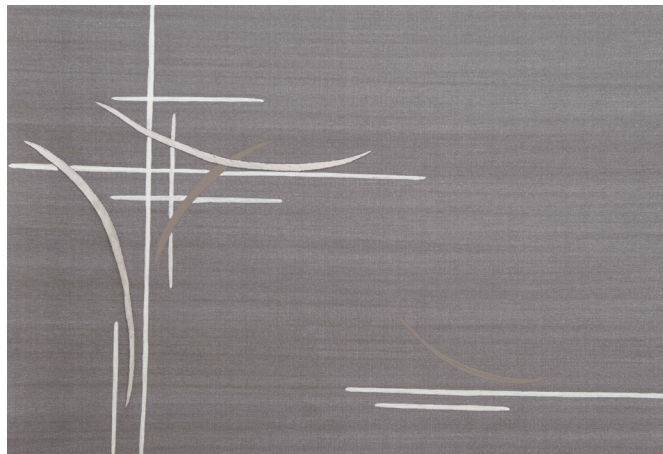
05 Excoffon on Manganese Strata