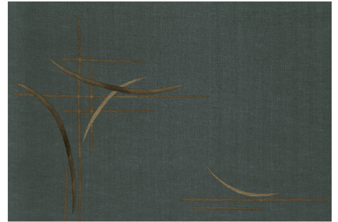
03 Renner on Capri Faille