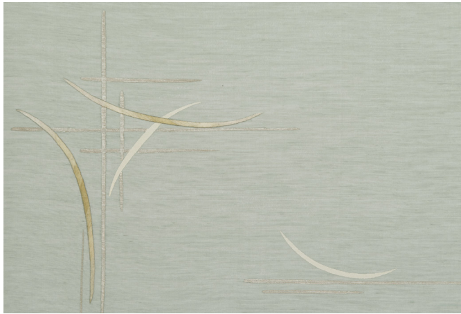
01 Miedinger on Breeze Faille