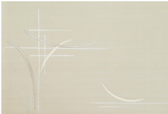
04 Gill on Strontium Strata