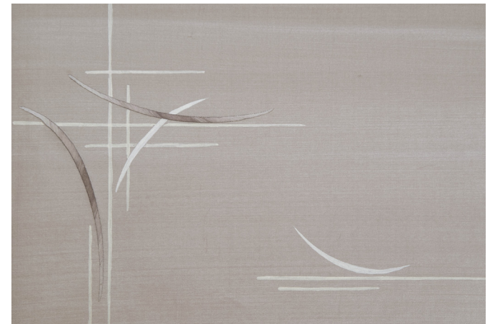
06 Morison on Selenium Strata