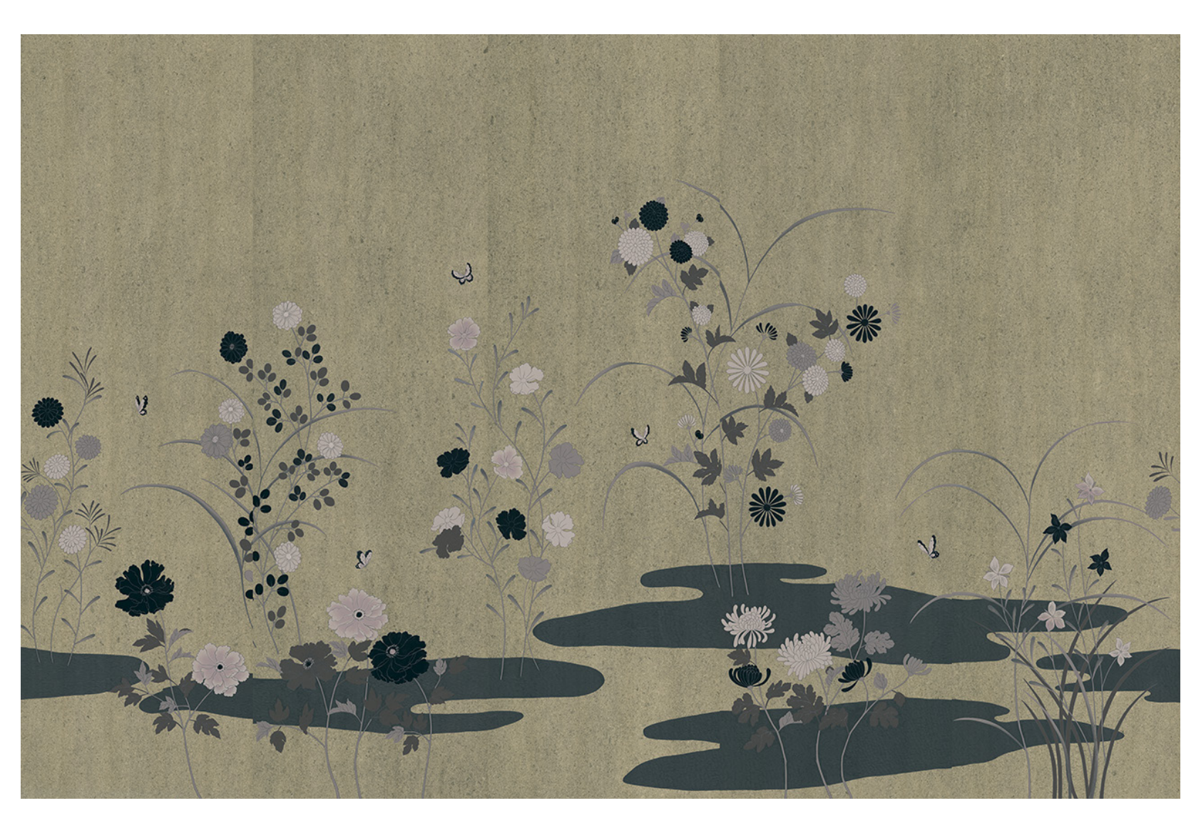
03 Ebony Frost