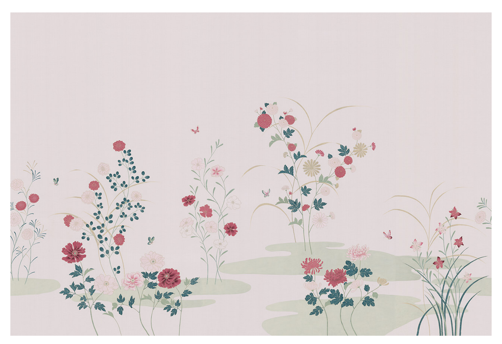
01 Celadon Rose