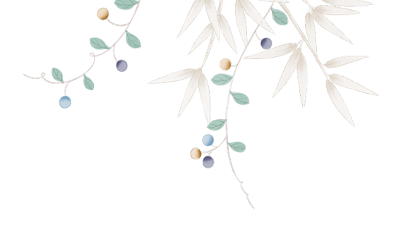
Panels 7 - 8