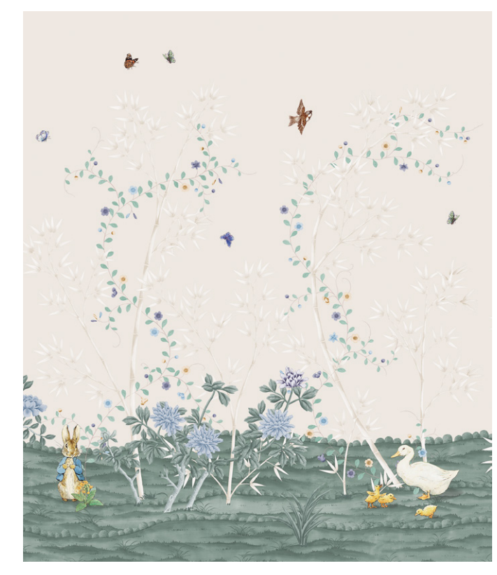
05 Belton House