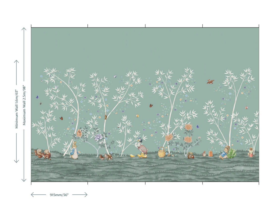
Layout A - Supplied as 2.5m panels - Recommended for wall heights ranging from 1.6m - 2.5m

The layout has been designed with a deep grass ground to allow for Peter and his friends to be visible above furniture.