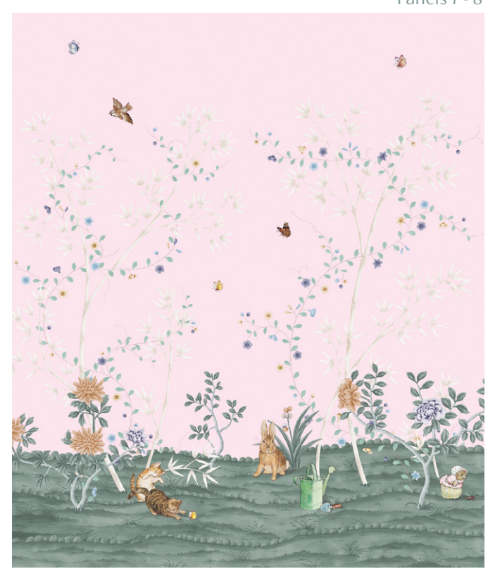
04 Pavilion Pink