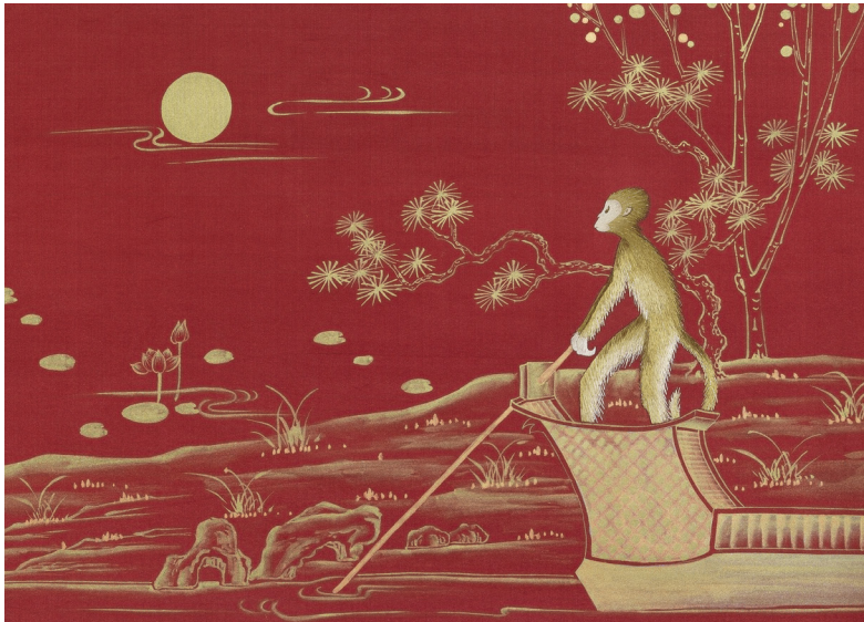
01 Tamarin on Crest Red Silk