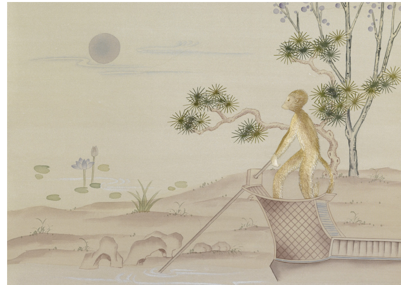
03 Loris on Custom Strata Silk