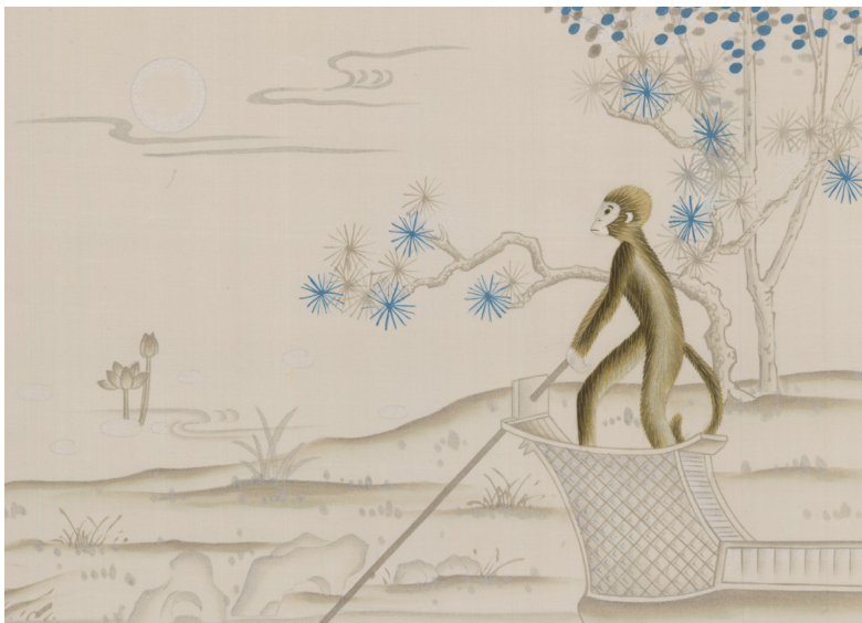
05 Vervet on Moonlight Silk