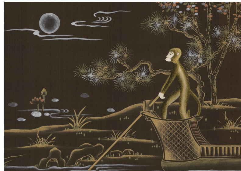
06 Barbary on Mahogany Silk