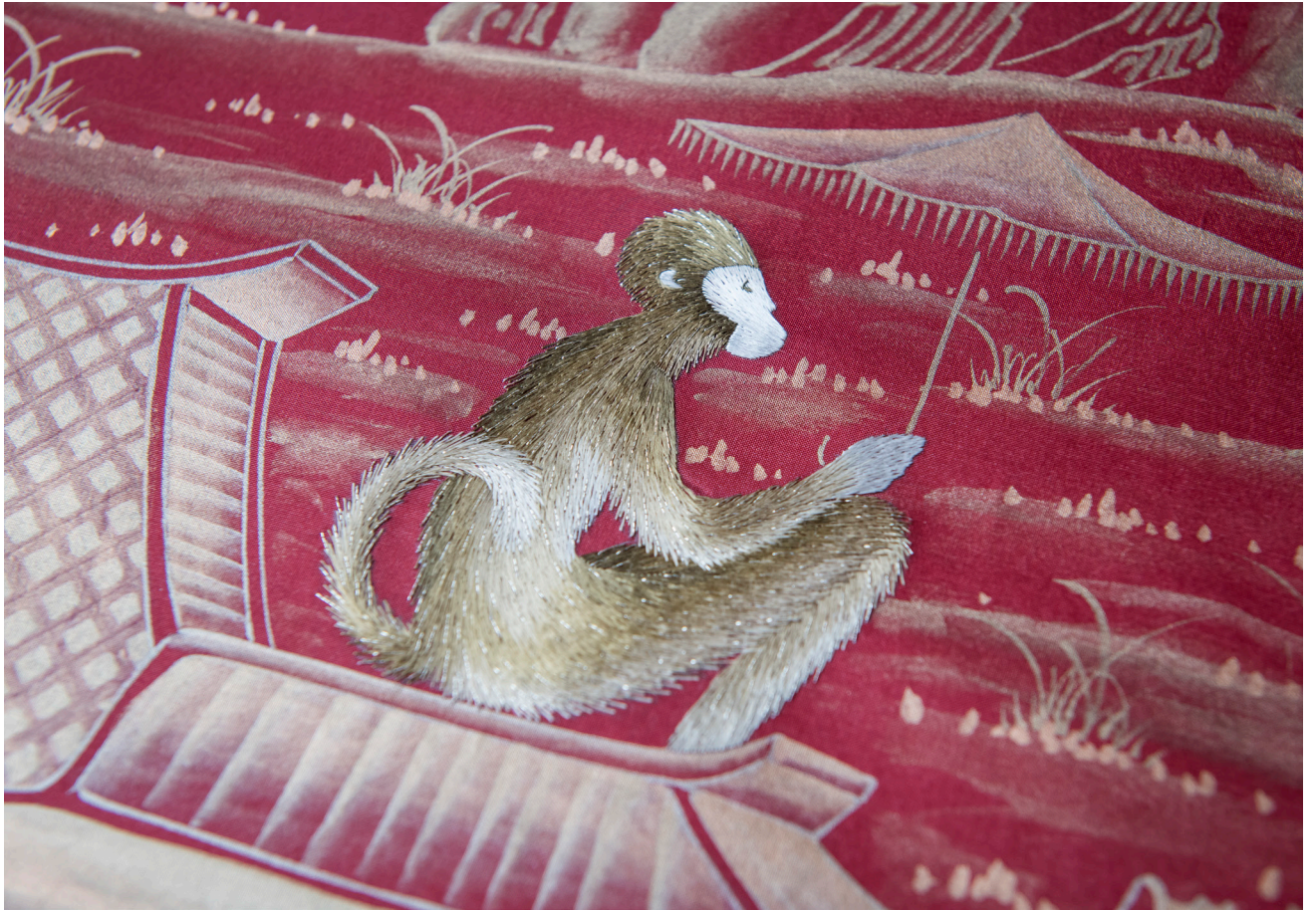
IMAGE Close-up of Singerie in Tamarin

The delicate hand-embroidered monkeys and exquisite hand-painting exhibits the skills of our artisan painters and embroiderers.