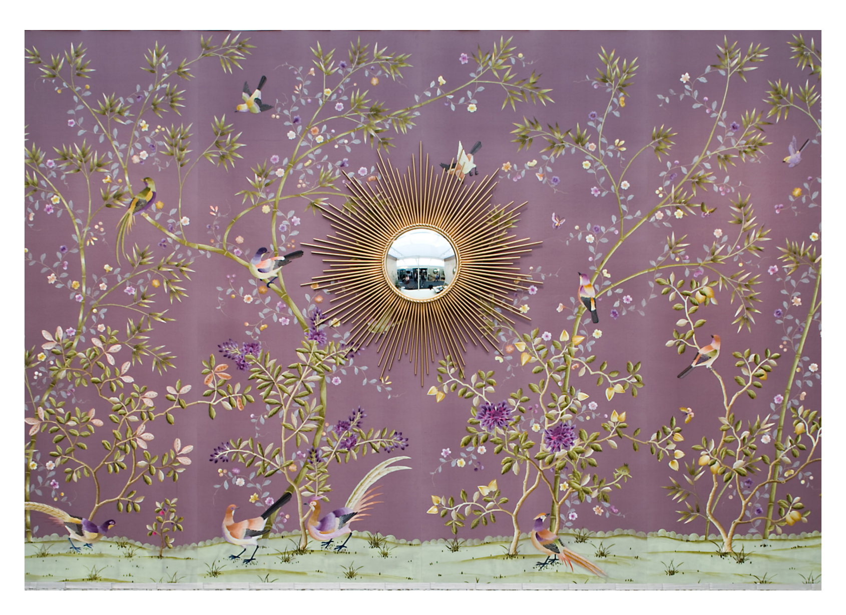
Paradiso in Fern