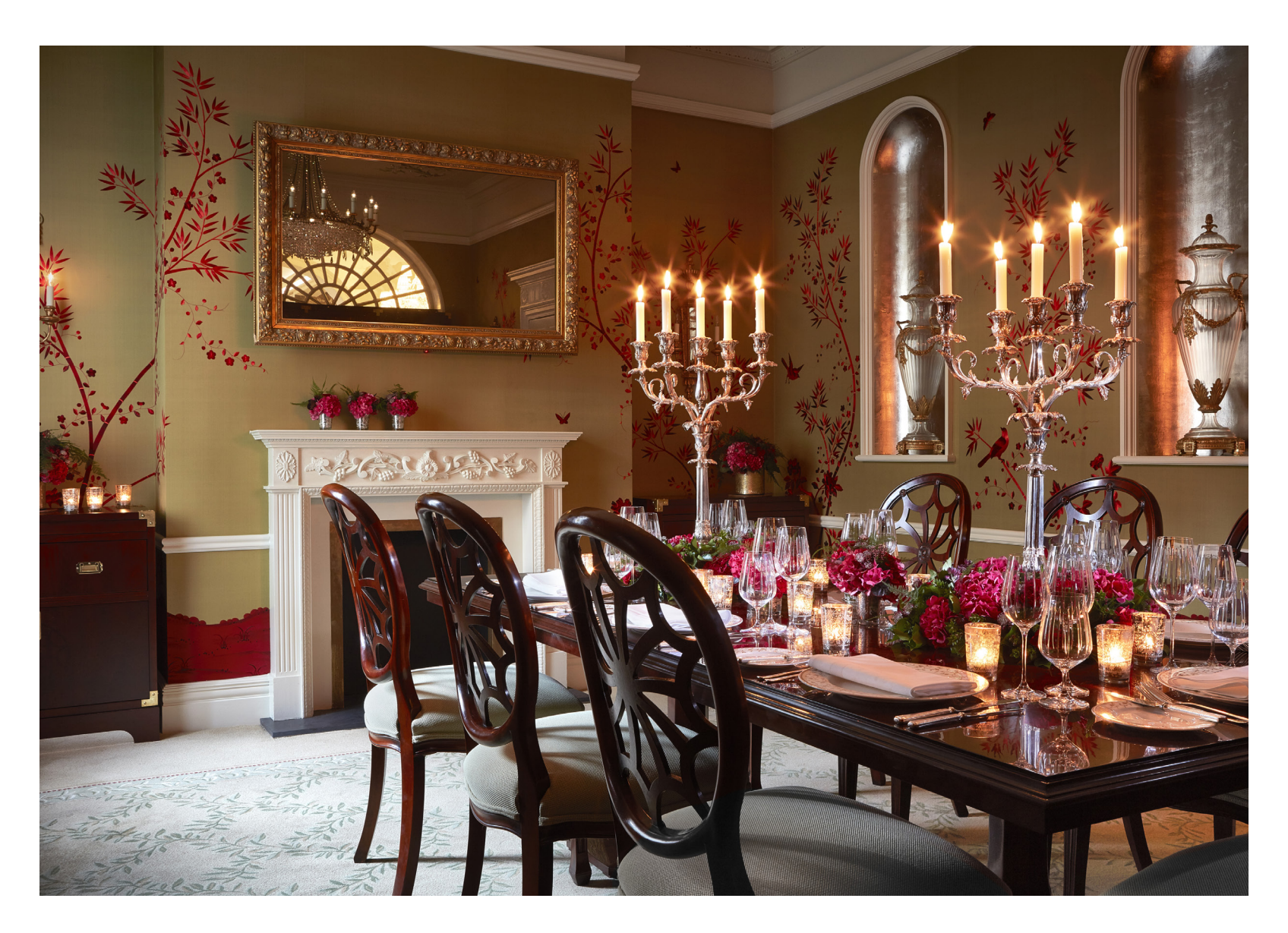
Cibar in Blood Olive