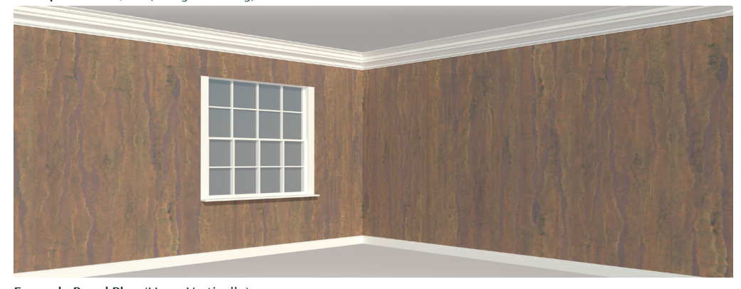
Example Panel Plan (Hung Vertically)