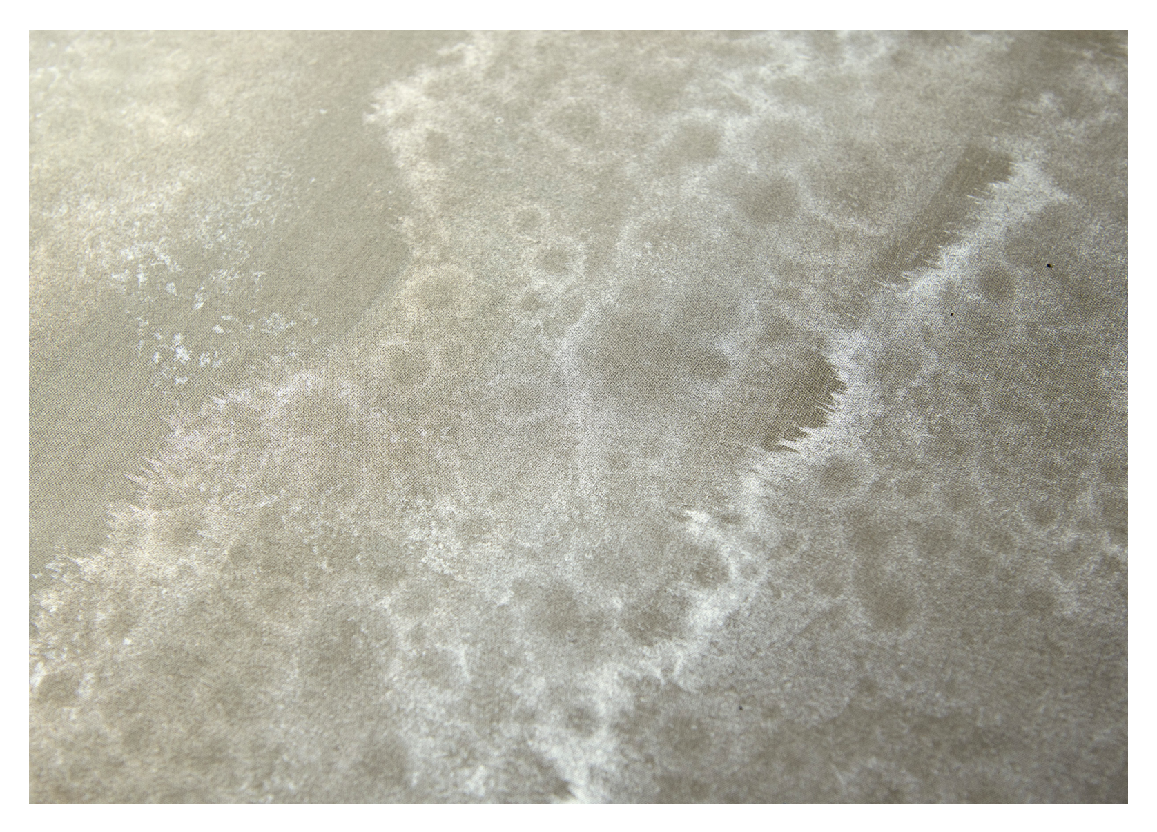
Saltwood in Ingenii