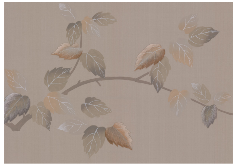
07 Ventum on Pebble Silk