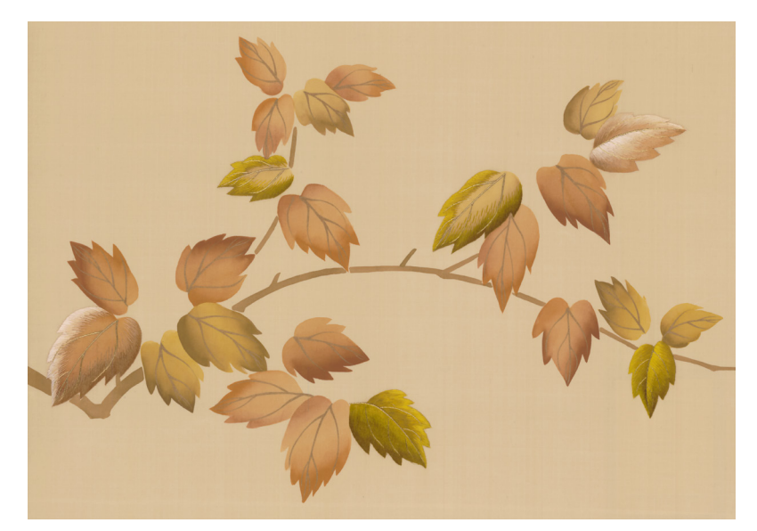
02 Furrow on Manilla Silk