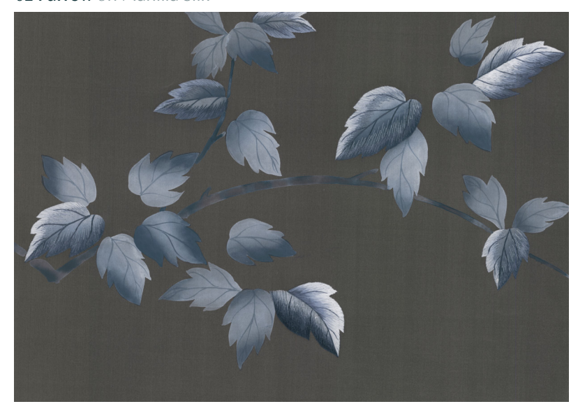
06 Tempest on Graphite Silk