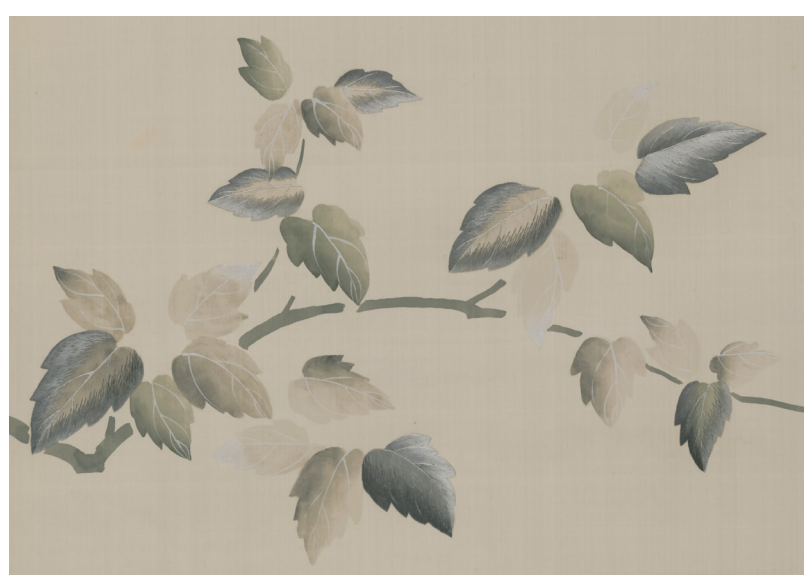
05 Lagune on Pumice Silk