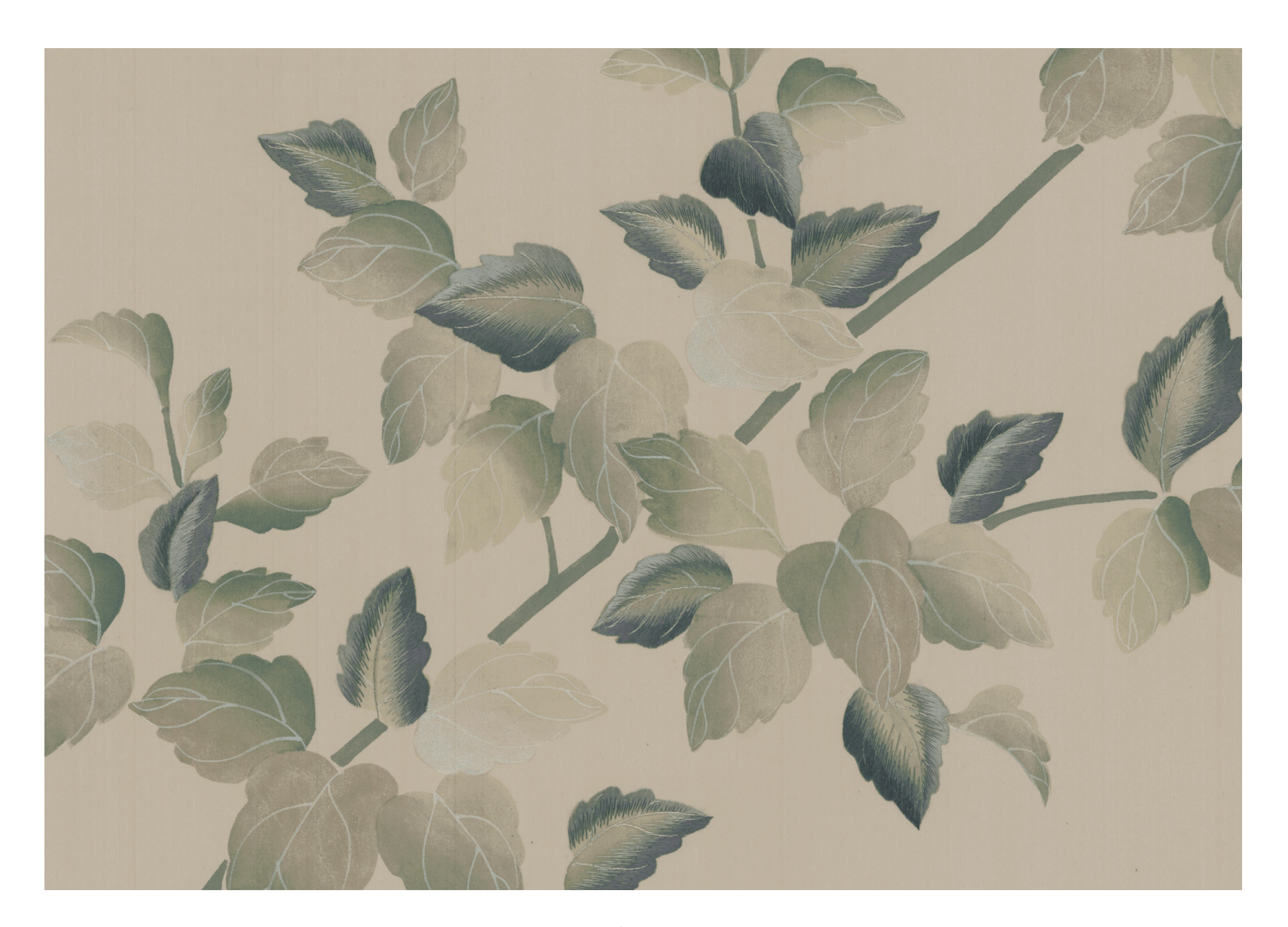
Keats in Lagune