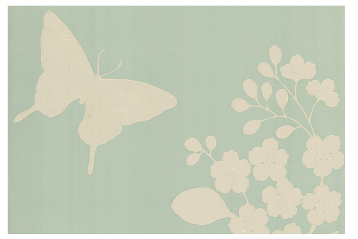
10 Lewis on Cardigan Silk