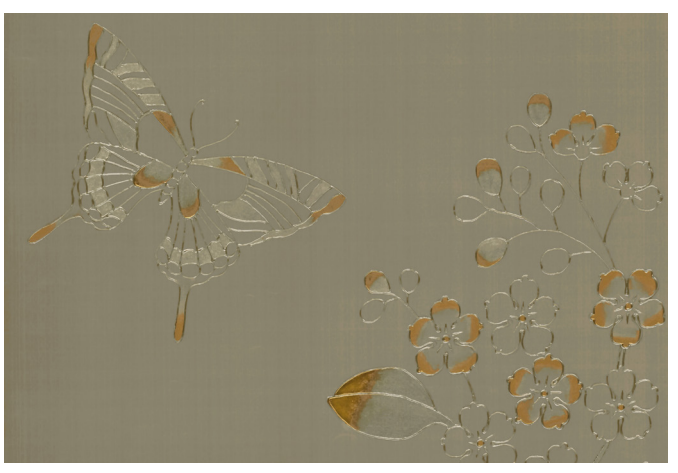
12 Hillary on Steel Silk