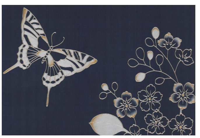
14 Aldrin on Bayou Blue Silk