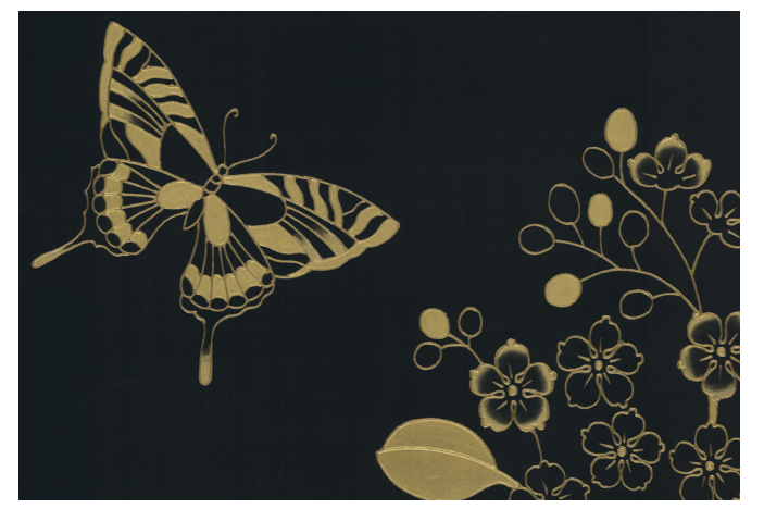
09 Tenzing on Black Silk