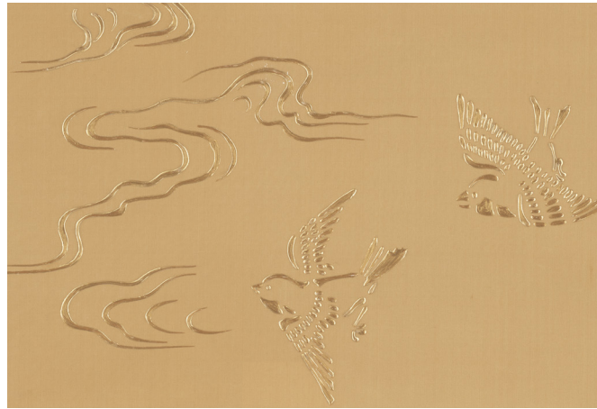
02 Unzen on Sahara Silk