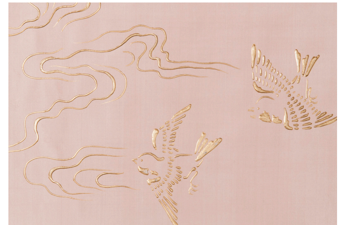
08 Asama on Mademoiselle Silk