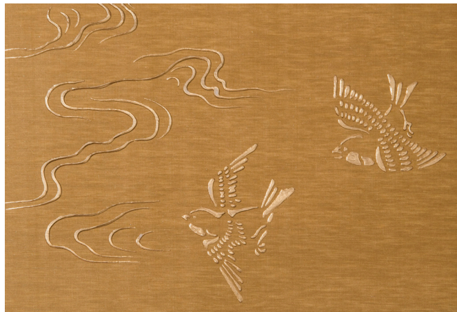
07 Aso on Woodbine Faille