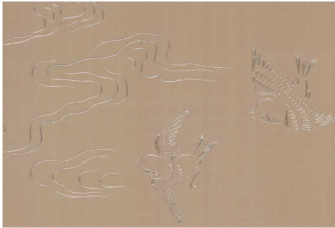
01 Sakura on Pebble Silk