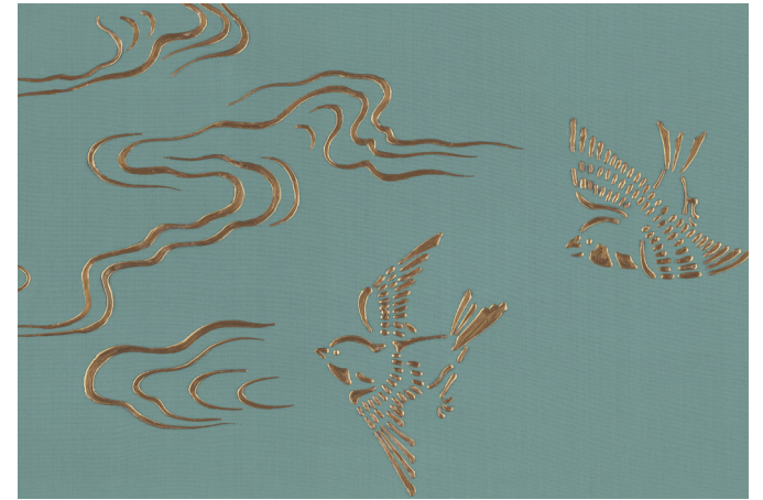
04 Fuji on Canton Silk