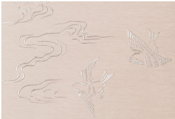
06 Tsurumi on Pearl Grey Faille