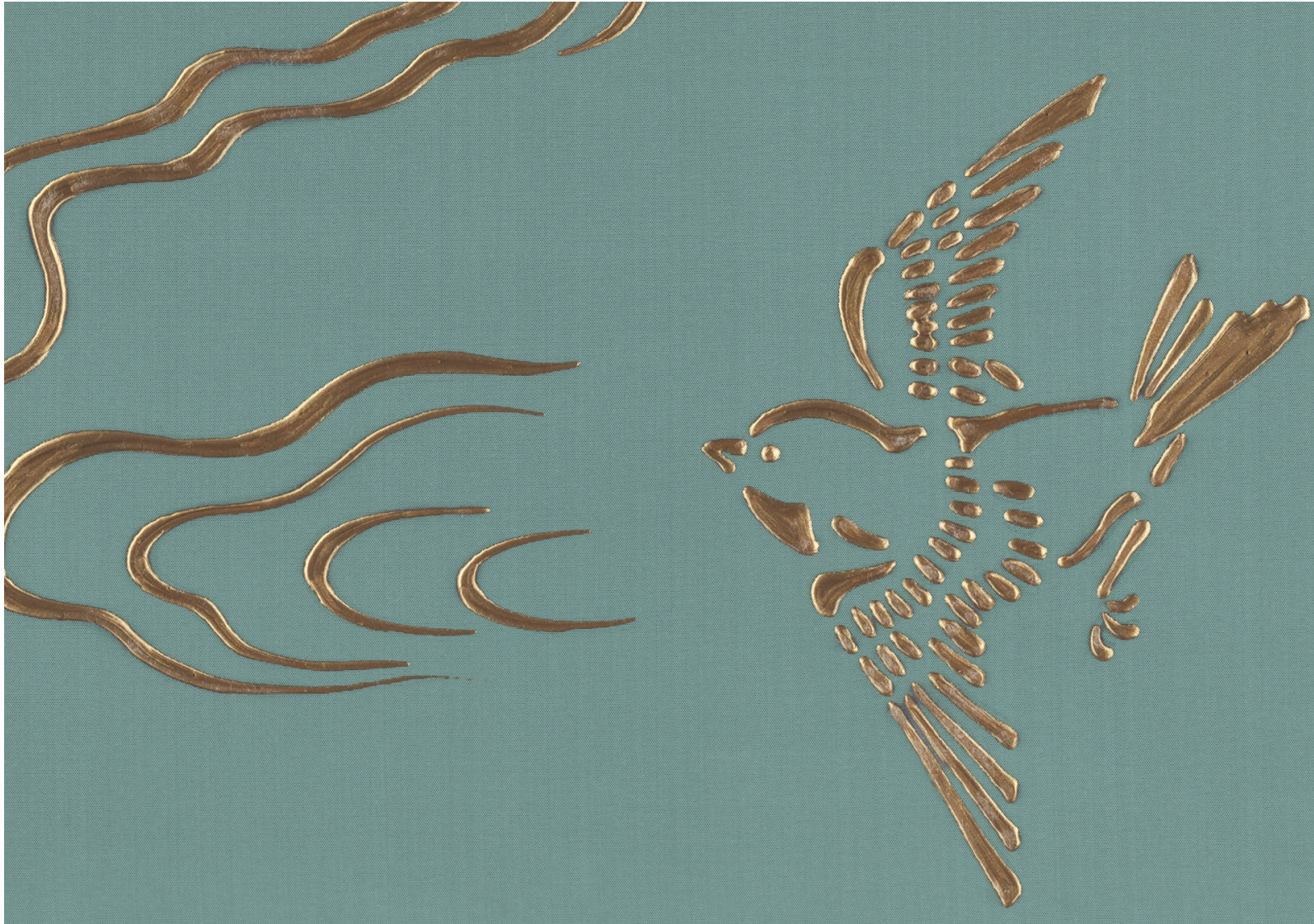
Mishima in Fuji