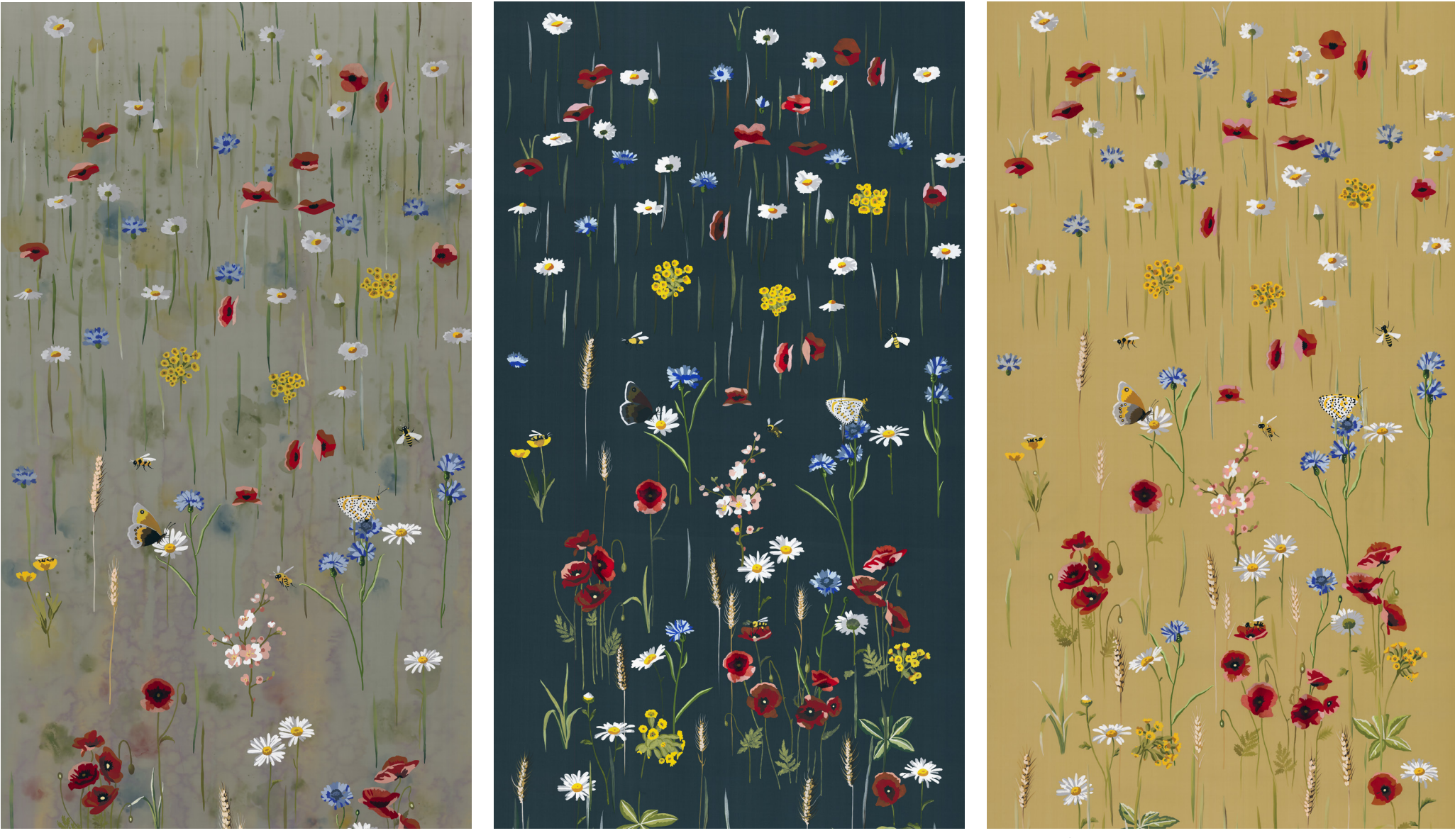
01 Spring Mist with Haze effect on Cardigan Silk