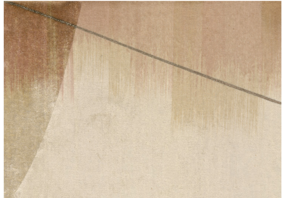
02 Copper on Paper Backed Velvet

This cloud-like blue colourway evokes calm and space. Painted hues and textural relief intersect, softly, like a patina drawn into velvet.