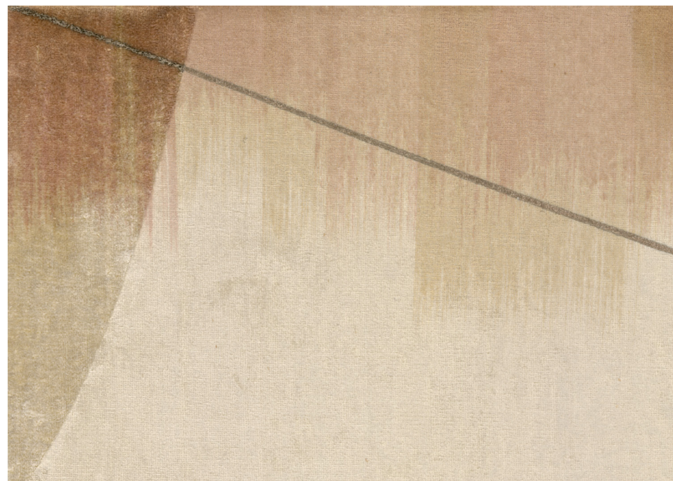
02 Copper on Paper Backed Velvet

This cloud-like blue colourway evokes calm and space. Painted hues and textural relief intersect, softly, like a patina drawn into velvet.