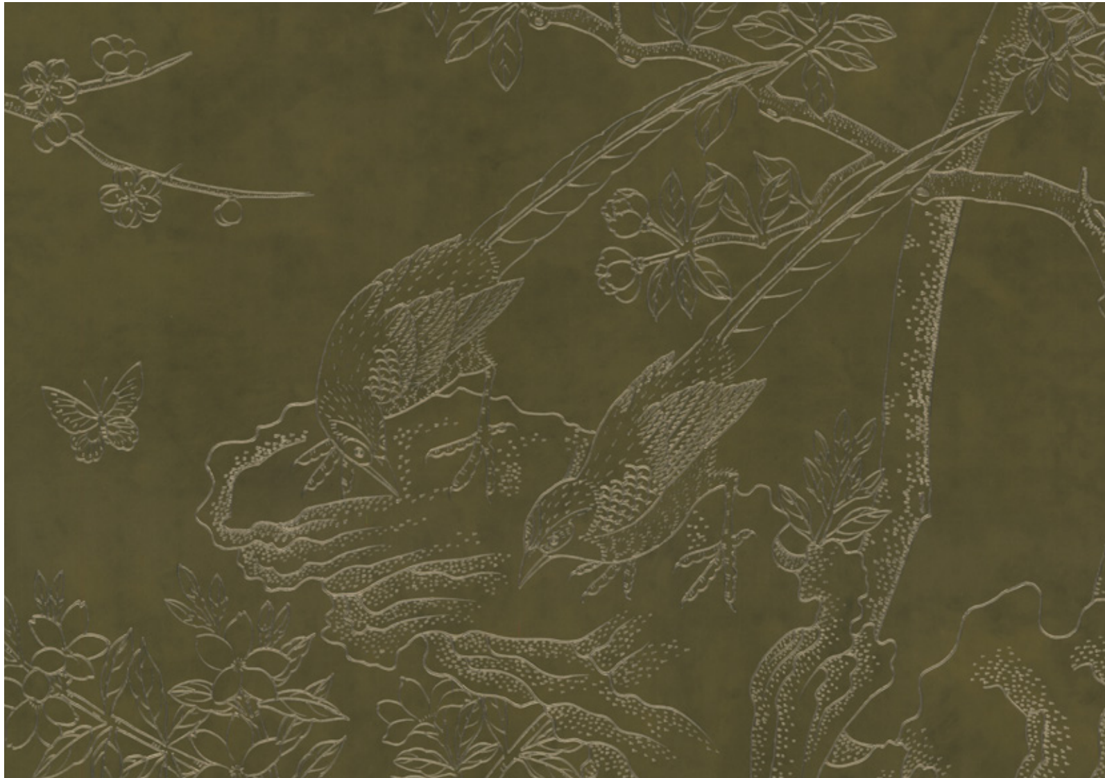
Cloisonné in Fez