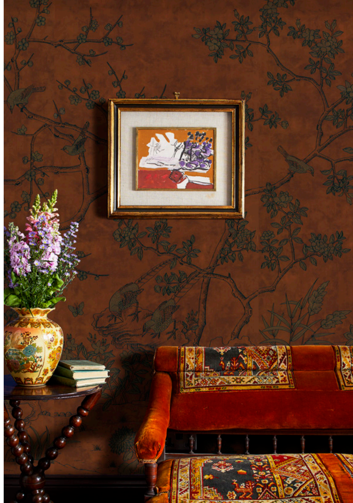
FRONT COVER IMAGE Cloisonné Folly in Fez RIGHT-HAND IMAGE Cloisonné Folly in Cordovan

A simple but effective chinoiserie, our Cloisonné Chinois is a reprisal of our cloisonné technique applied to our Buckskin ground. Rendered onto this lacquered ground, our classic Chinoiserie patterns embodies is rich and illustrative, an ode to the ancient metalwork technique.