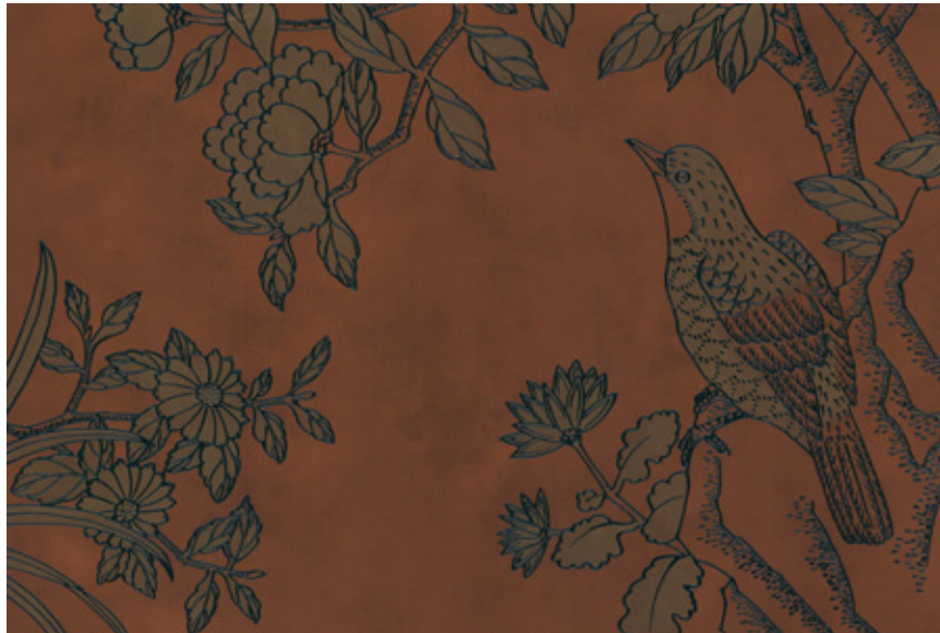
01 Cordovan on Tan Buckskin