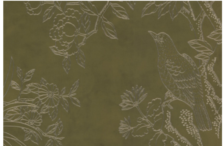
02 Fez on Turtle Buckskin