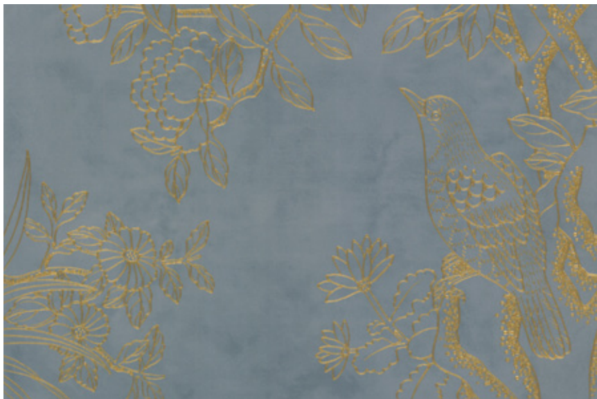
03 Patina on Sea Mist Buckskin