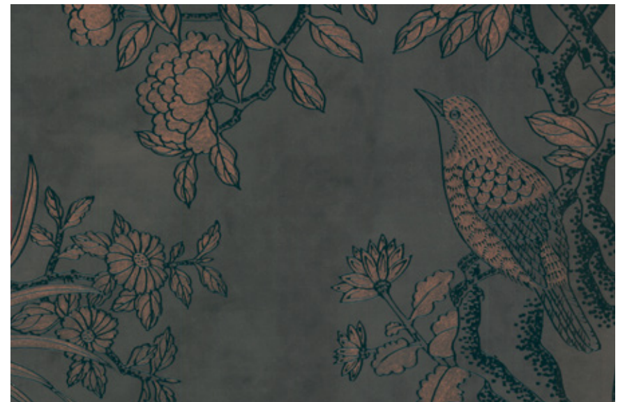
04 Nubuck on Gull Buckskin