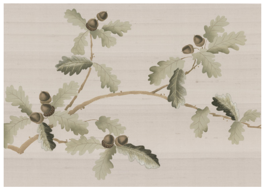
01 Bur on Enoki Dupion Silk