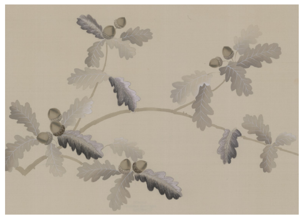
02 Fig on Moonlight Silk