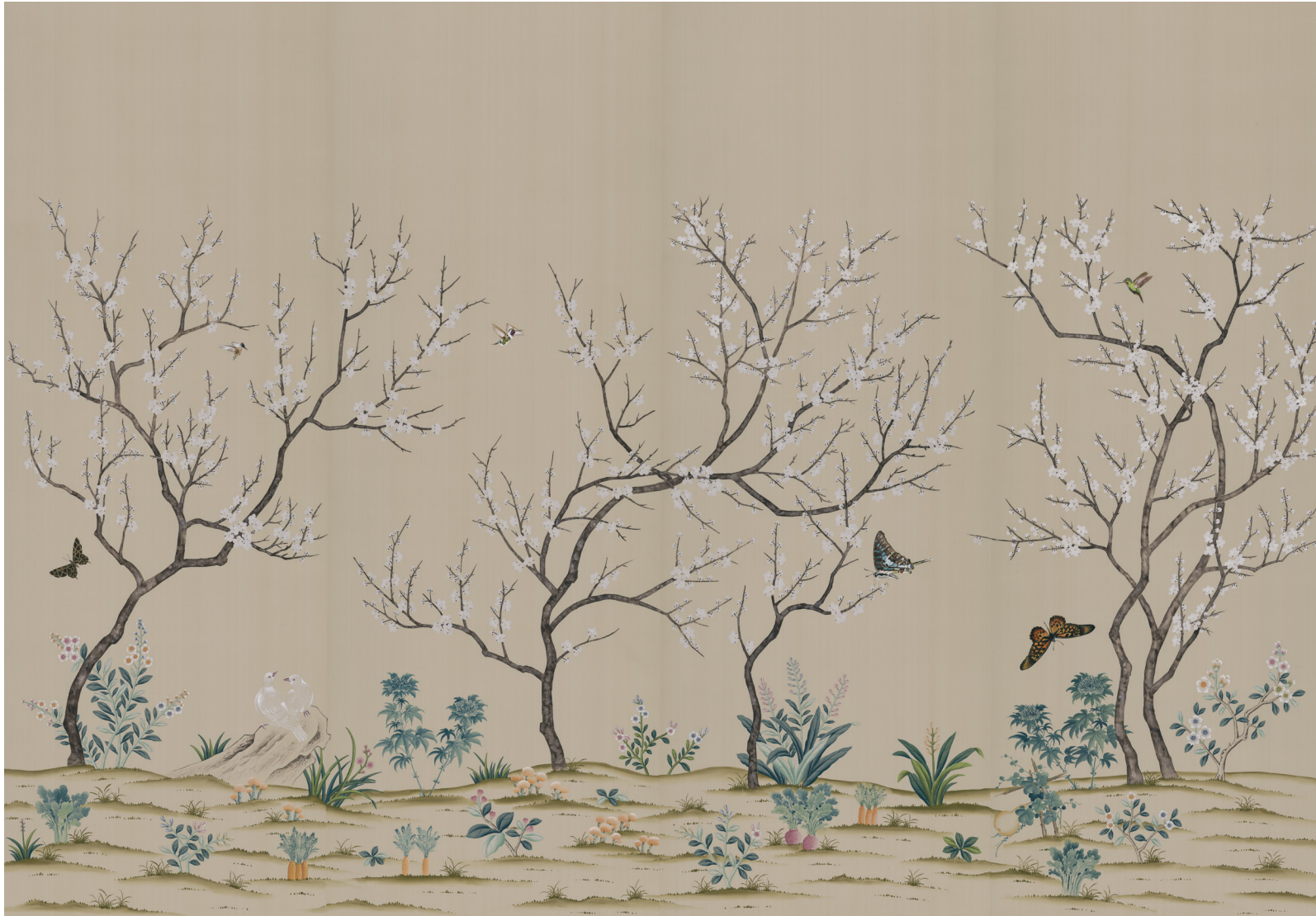
01 Dawn on Platinum Silk