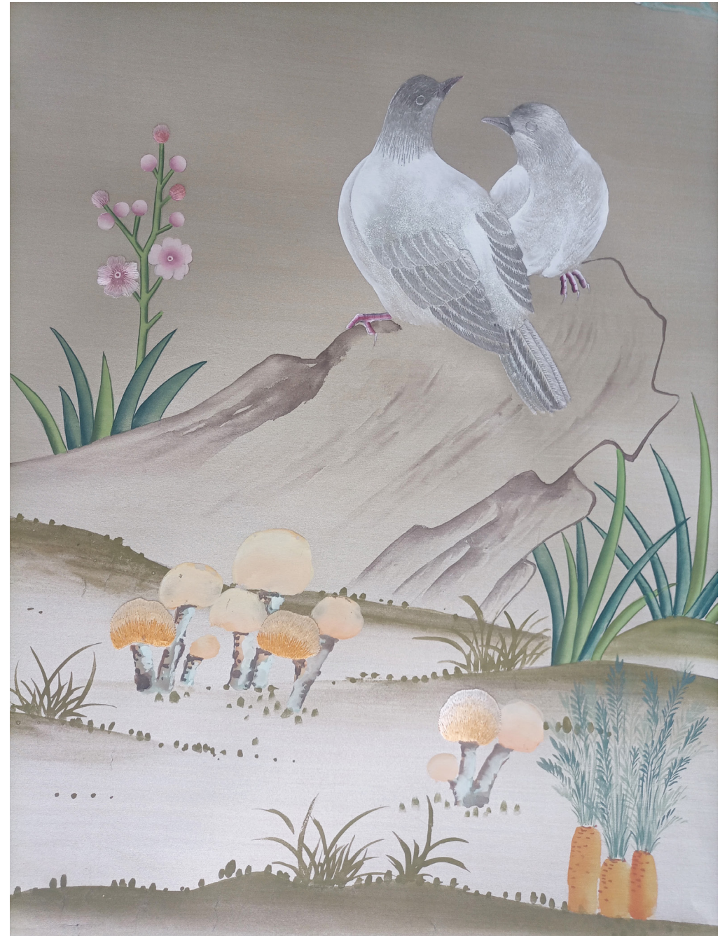
IMAGE Close-up of Along the Wild Path in Dawn

Our embroiderers work with unspun silk floss for incredibly fine stitching, with 600 stitches in a single blossom. An individual panel can take up to 400 hours to complete.