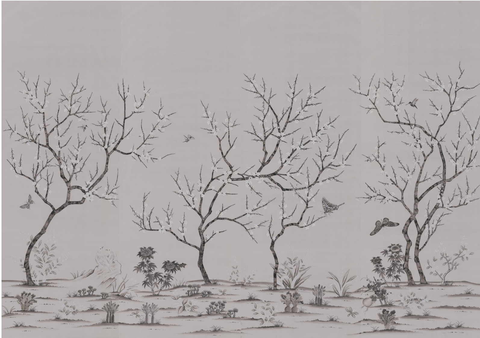
02 Dusk on Custom Strata Silk