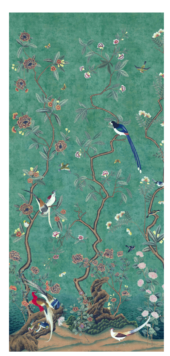
02 Pavone on Tea Paper