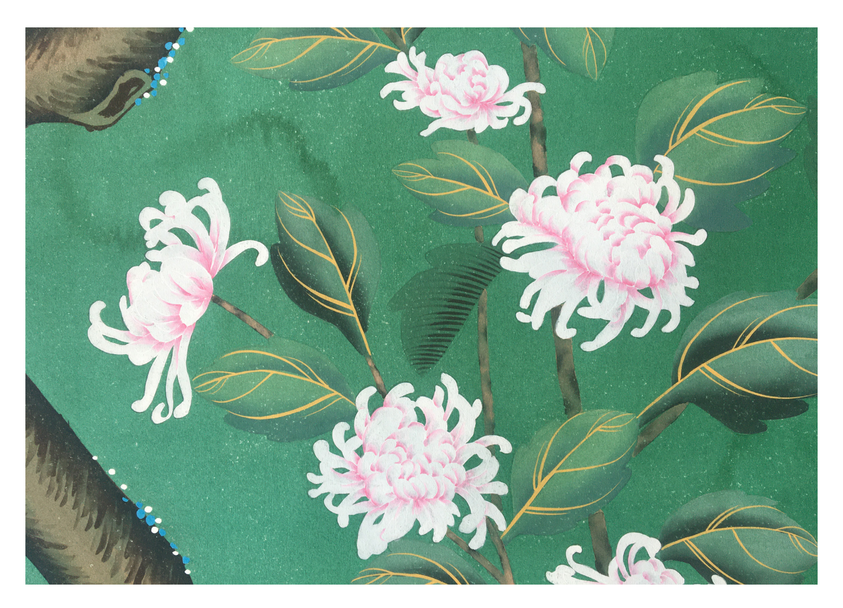
Raineri in Pavone