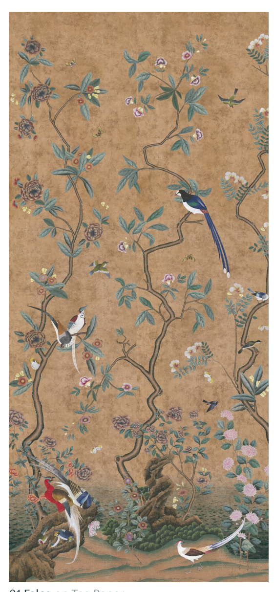
01 Falco on Tea Paper