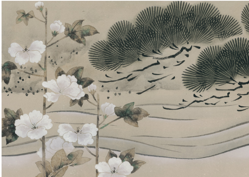
01 Sumi on Tea Paper Serenely monochromatic, Sumi features an array of muted greens and greys.