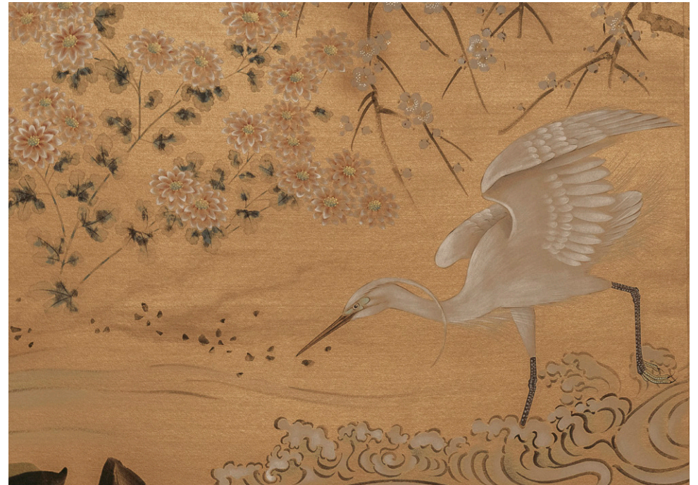
02 Bronzu on Metallic Tea Paper Bronzu conjures traditional gilded Japanese screens and provides a lavish backdrop for Haiku's exquisitely rendered flora and fauna.