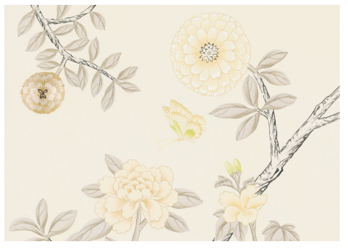
02 Lutetia on White Silk