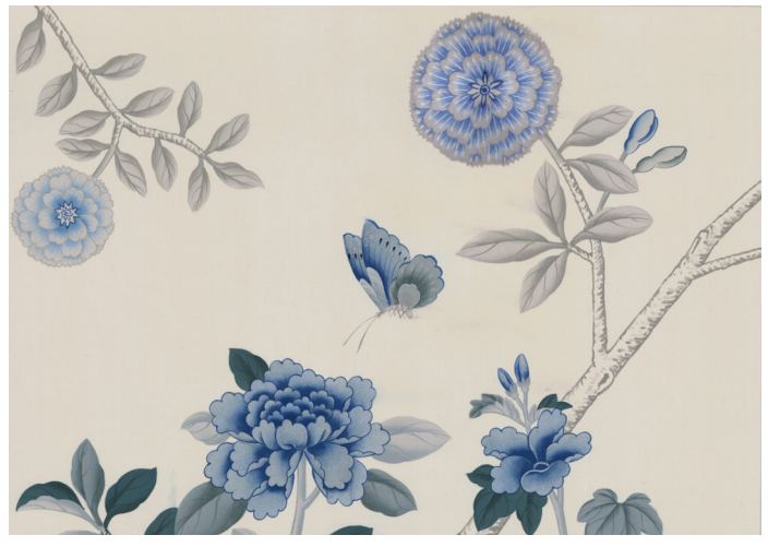
04 Saphir on White Silk