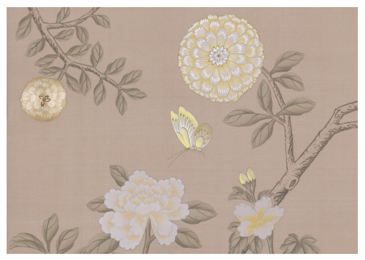
01 Vendome on Selenium Strata