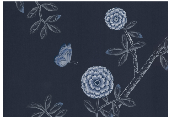
03 Vosges on Indigo Silk