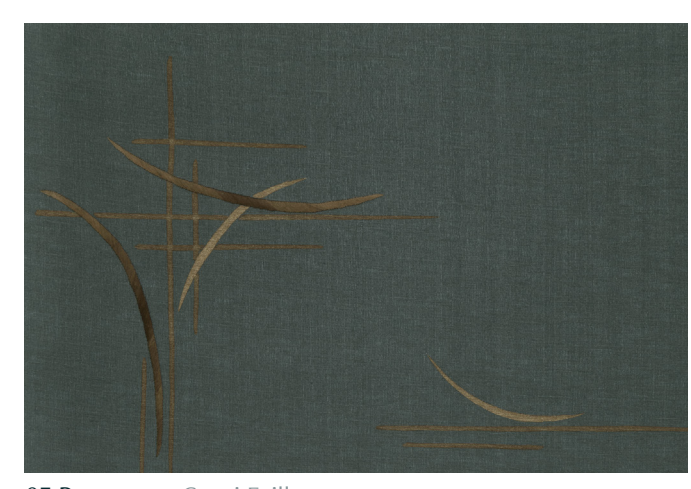
03 Renner on Capri Faille