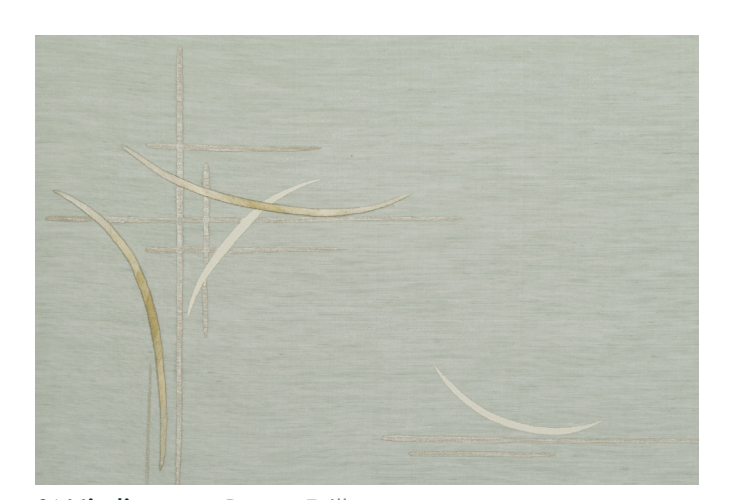
01 Miedinger on Breeze Faille