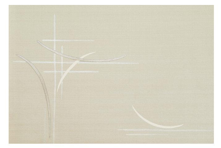
04 Gill on Strontium Strata