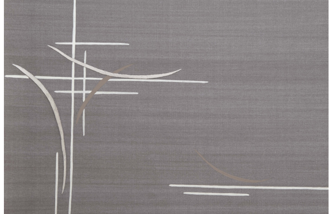
05 Excoffon on Manganese Strata