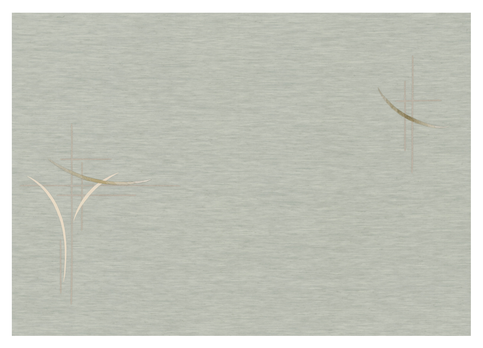
Miedinger on Breeze Faille