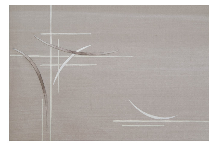
06 Morison on Selenium Strata