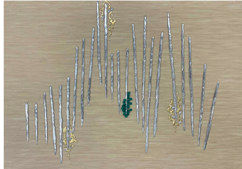
02 Blake Hand-Foiled and Hand-Embroidered on Pearl Grey Faille