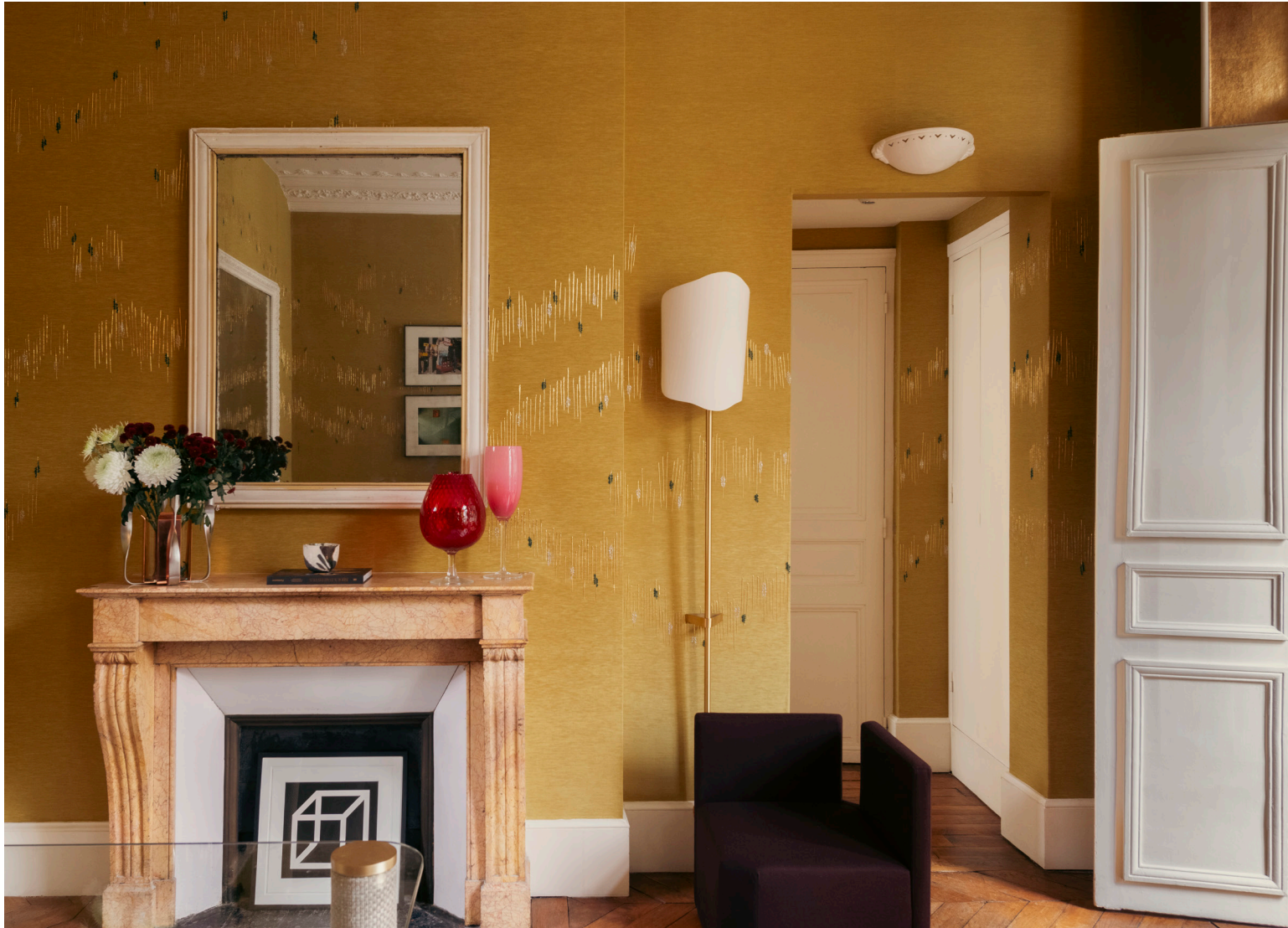
IMAGE Molten in Huxley