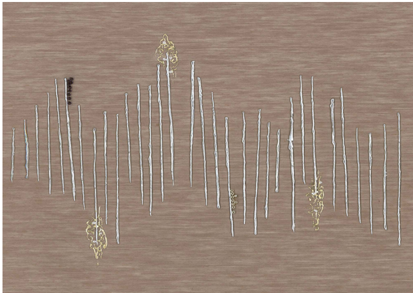
03 Enigma Hand-Foiled and Hand-Embroidered on Pelt Faille