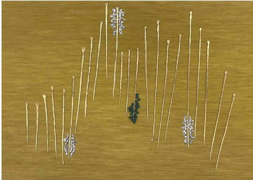
01 Huxley Hand-Foiled and Hand-Embroidered on Woodbine Faille