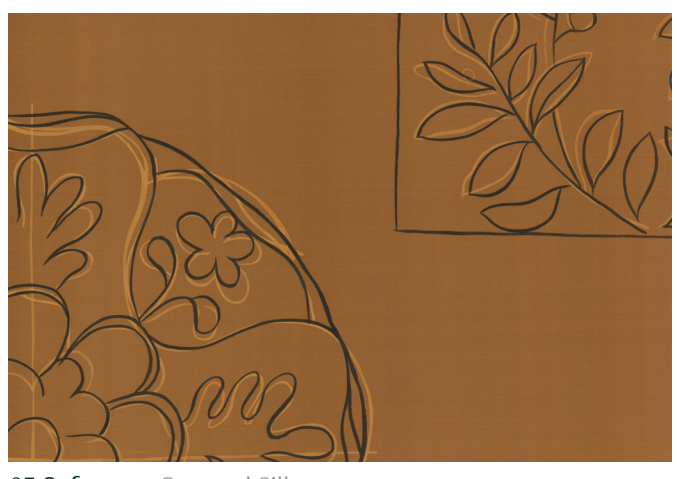
03 Safran on Caramel Silk