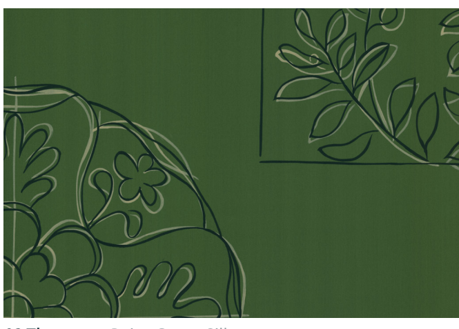
02 Thyme on Baize Green Silk