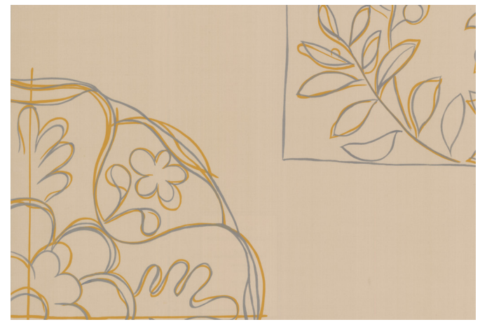
05 Vanilla on Platinum Silk