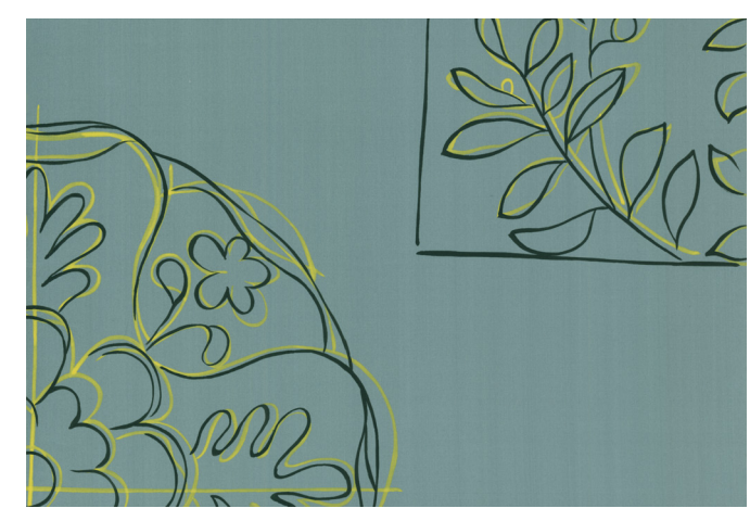
06 Ciel on Canton Silk