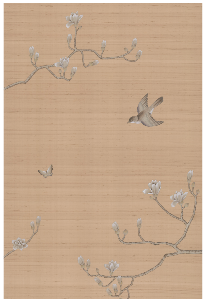
01 Anise on Cort Dupion