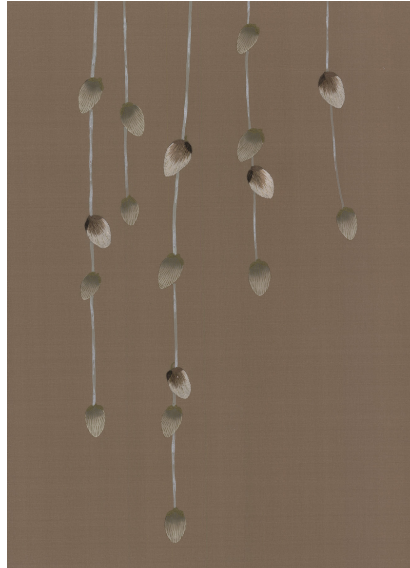
02 Tawny on Flint Silk