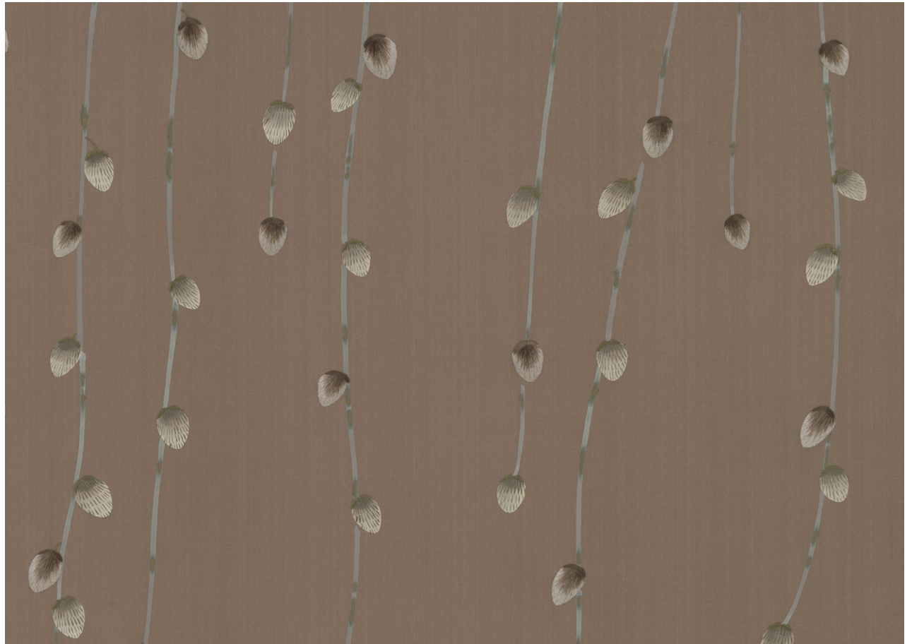
IMAGE Close up of Grey Willow in Tawny

Both colourways; Doe and Tawny, are fundamentally monochromatic but with touches of colour, to replicate catkins found in nature.