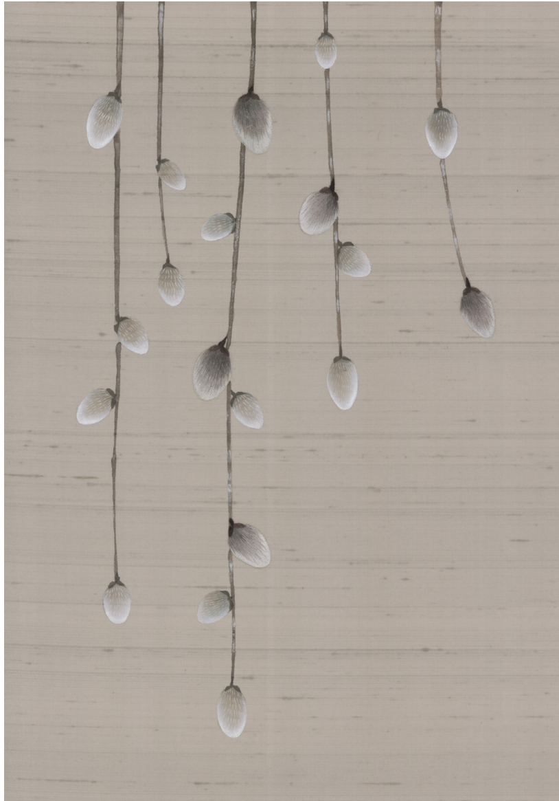
01 Doe on Enoki Dupion Silk