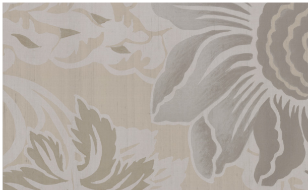
07 Earl Grey on Dupion Enoki