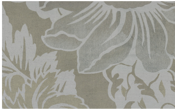
05 Sterling Silver on Gilded Linen