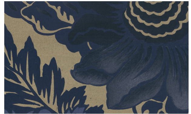
06 Starry Night on Gilded Linen