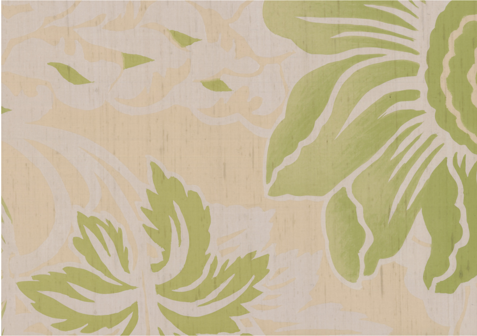
Broadlands in Sorrel