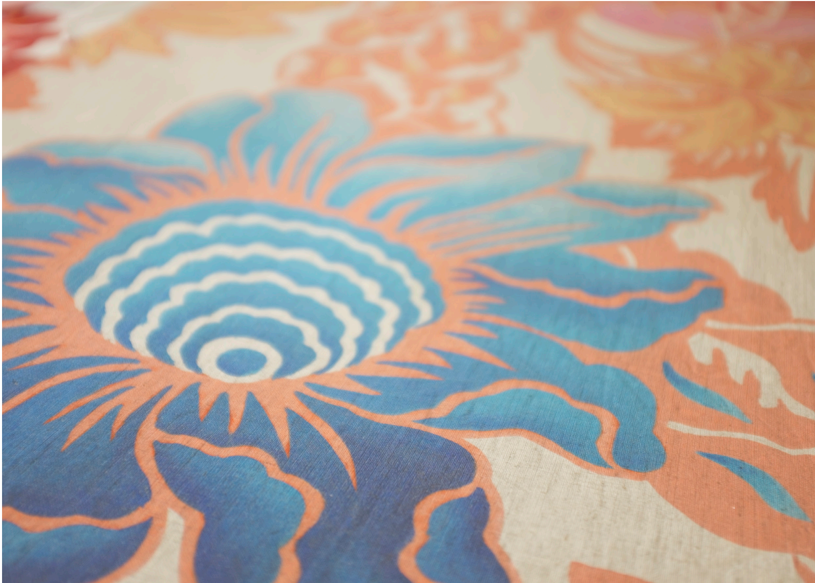
IMAGE Close-up of Broadlands in Blenheim Apricot