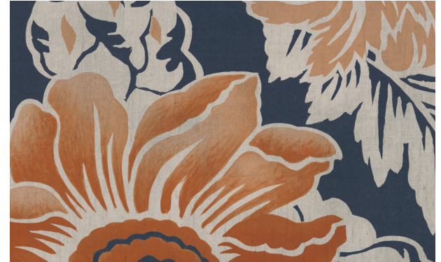
03 Perismmon on Emulsion Linen