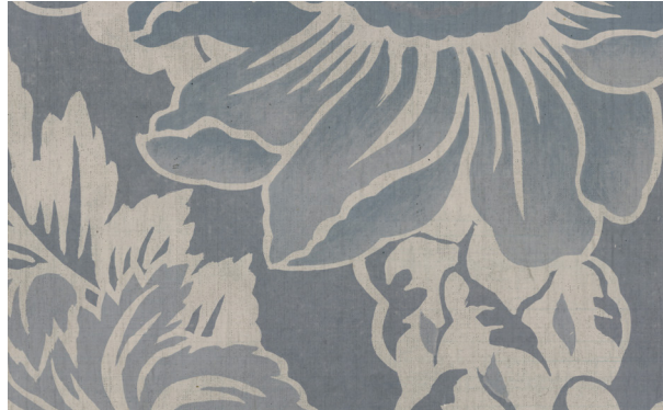
02 Portsmouth Blue on Emulsion Linen