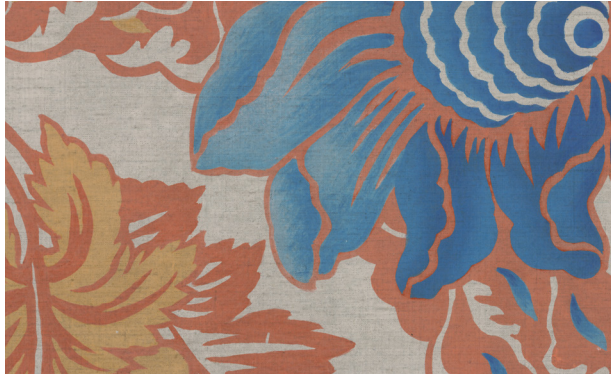
01 Blenheim Apricot on Emulsion Linen