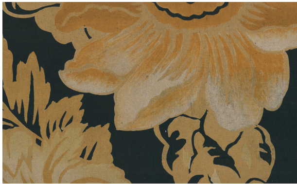
04 Goldenrod on Gilded Linen