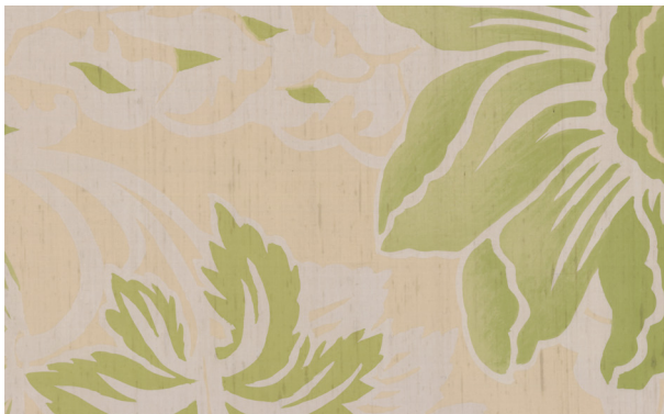
08 Sorrel on Dupion Abelone