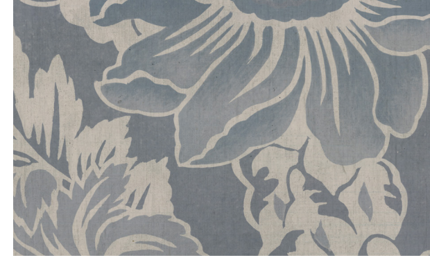
02 Portsmouth Blue on Emulsion Linen