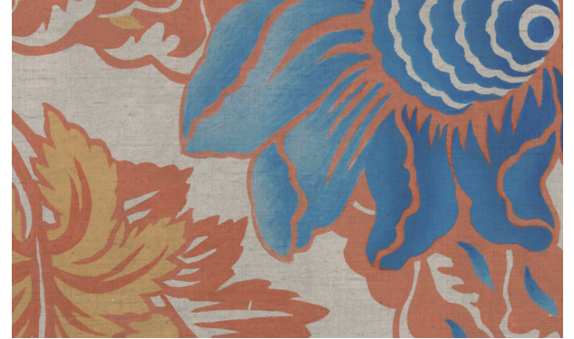
01 Blenheim Apricot on Emulsion Linen