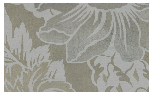
05 Sterling Silver on Gilded Linen