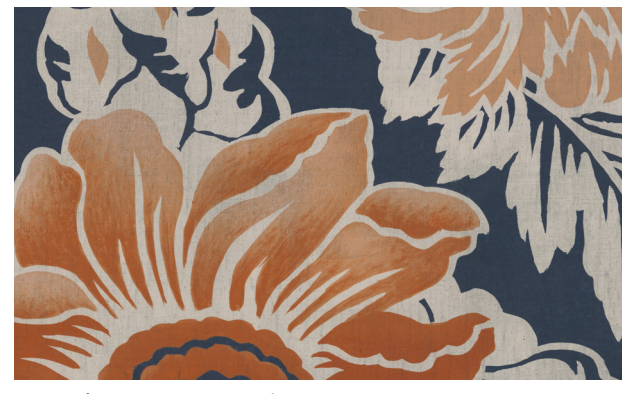
03 Perismmon on Emulsion Linen