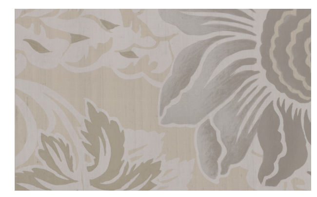
07 Earl Grey on Dupion Enoki