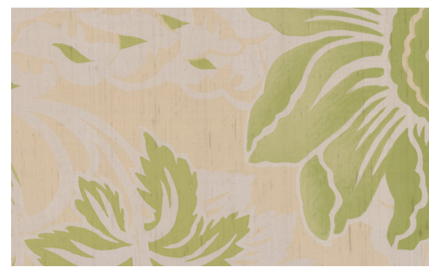
08 Sorrel on Dupion Abelone