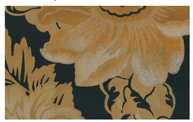
04 Goldenrod on Gilded Linen