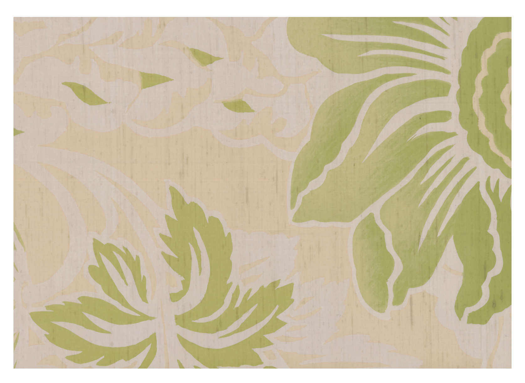
Broadlands in Sorrel