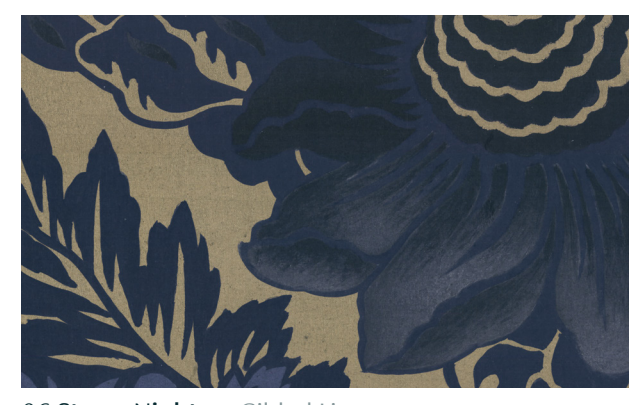
06 Starry Night on Gilded Linen