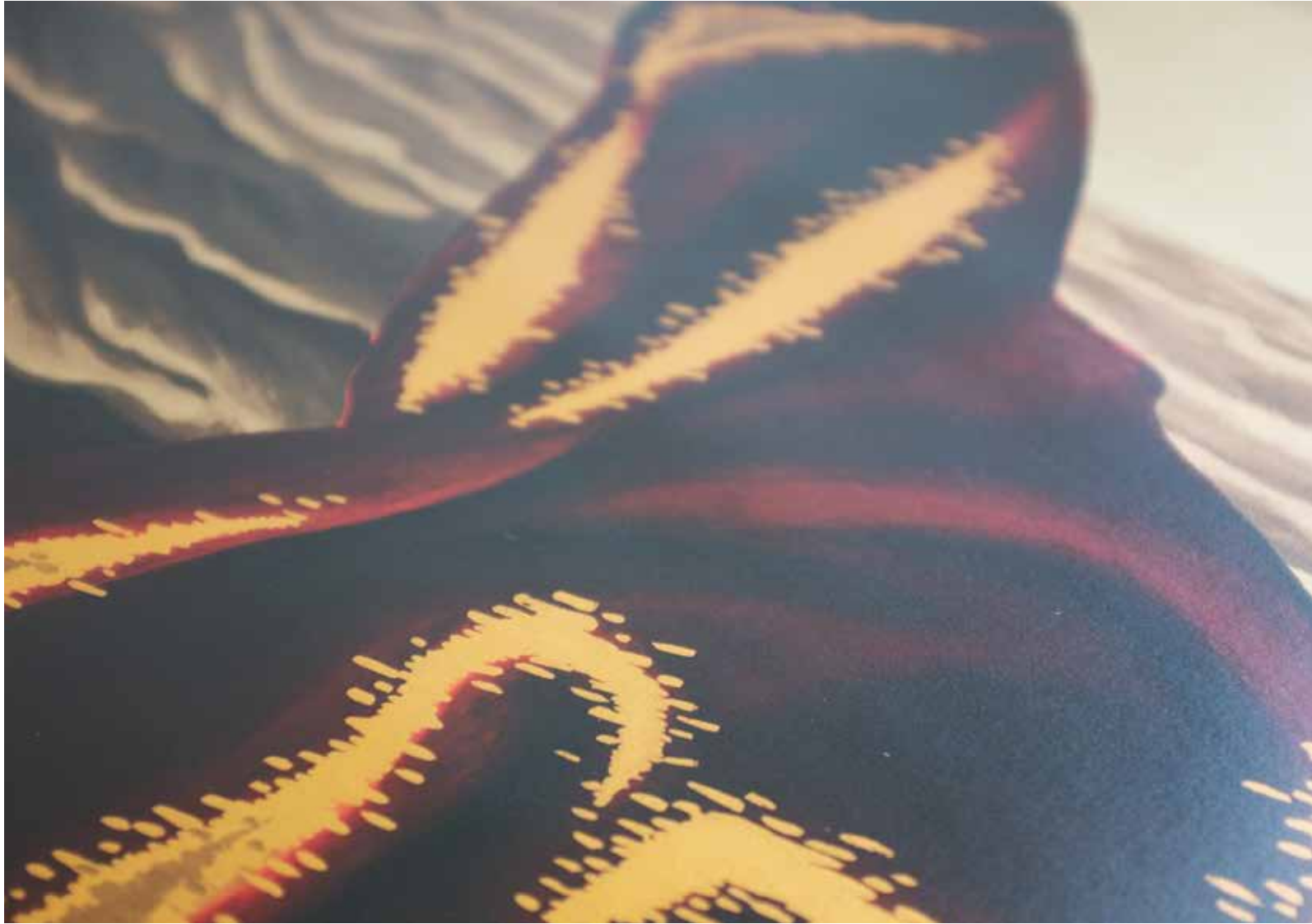
Drapery Waves in Royal Gold