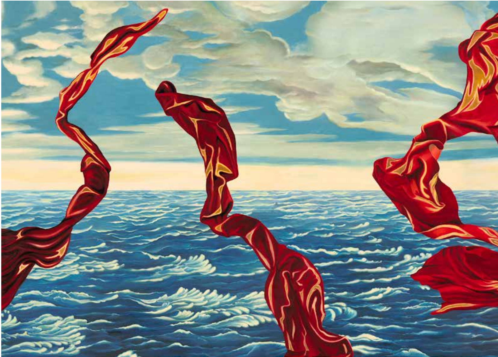
IMAGE Drapery Waves in Sert Red