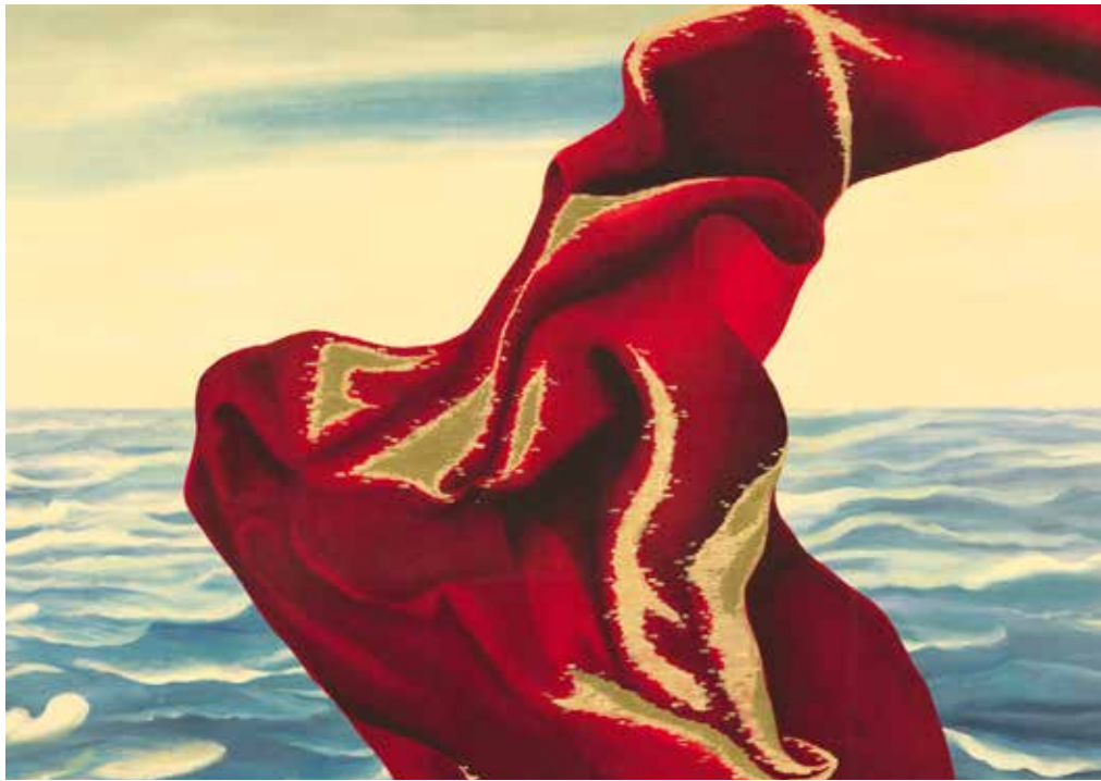
01 Sert Red on Cartridge