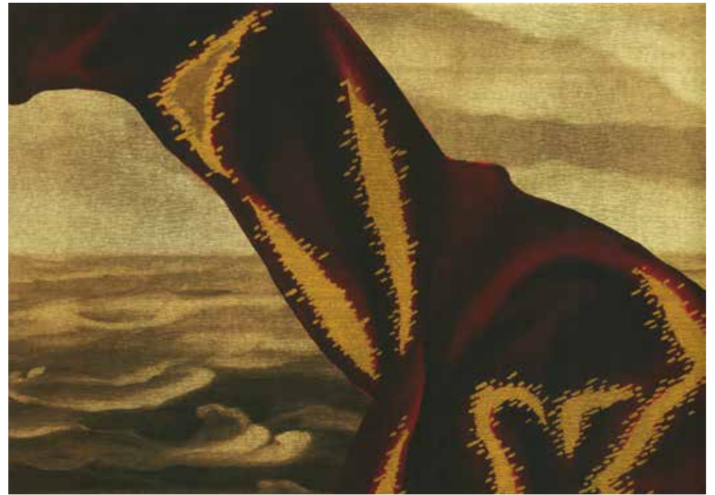
02 Royal Gold on Gilded Paper