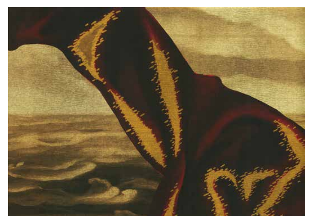
02 Royal Gold on Gilded Paper