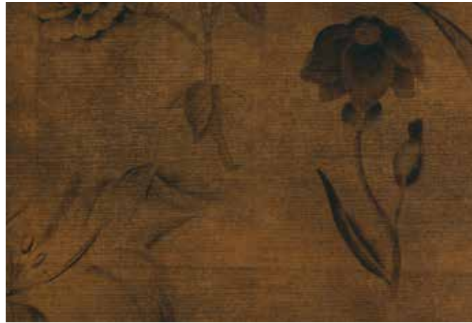
05 Spring Fever in Ocher on Hand-gilded Paper