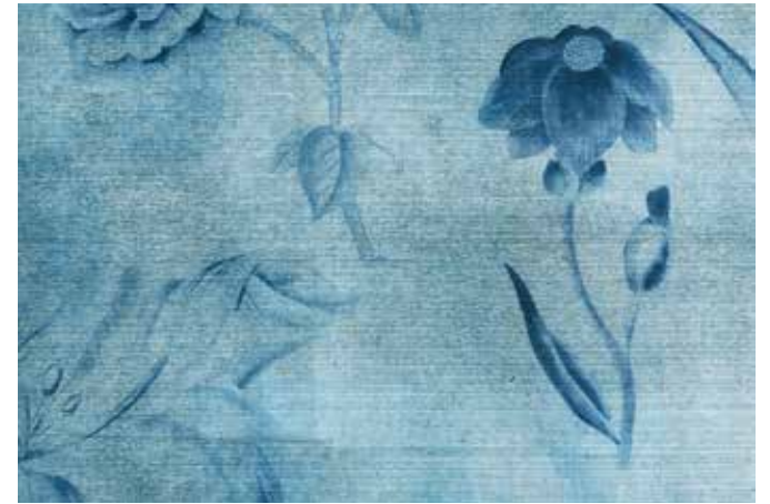
06 Spring Fever in Delft Blue on Hand-gilded Paper