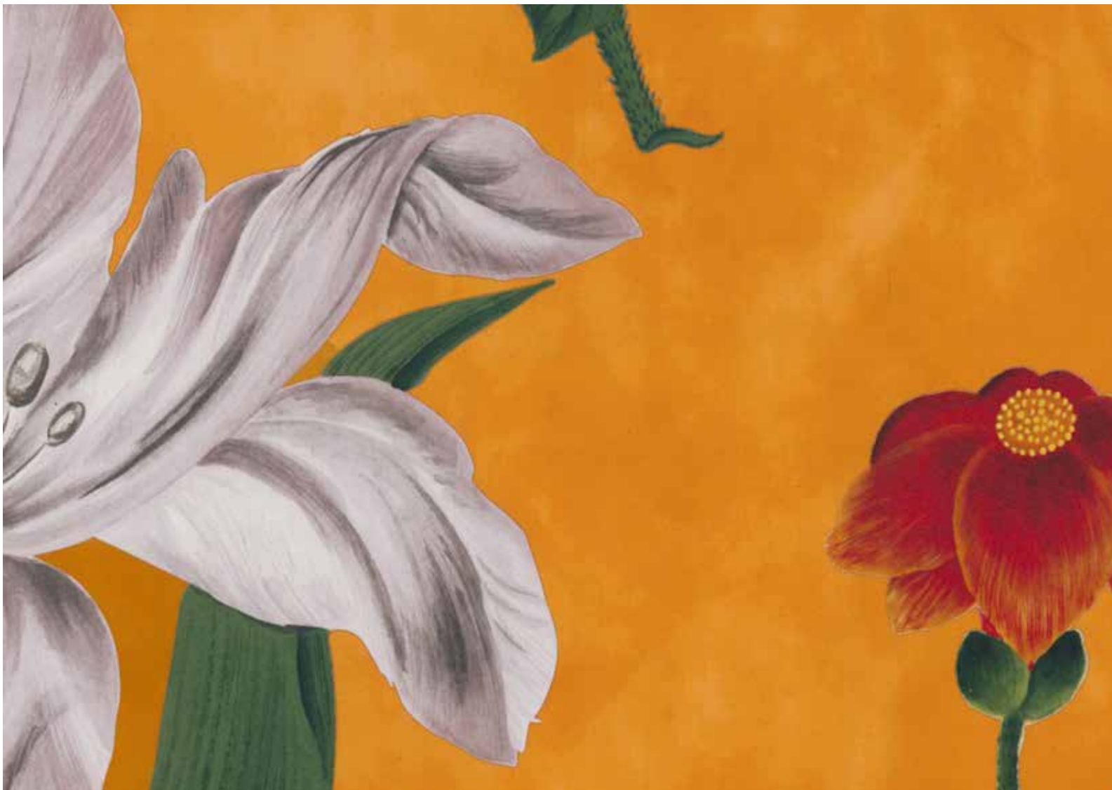
Spring Fever in Saffron