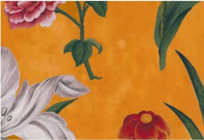
01 Spring Fever in Saffron on Buckskin Buttercup