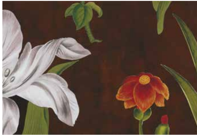
02 Spring Fever in Rembrandt Russet on Buckskin Auberge