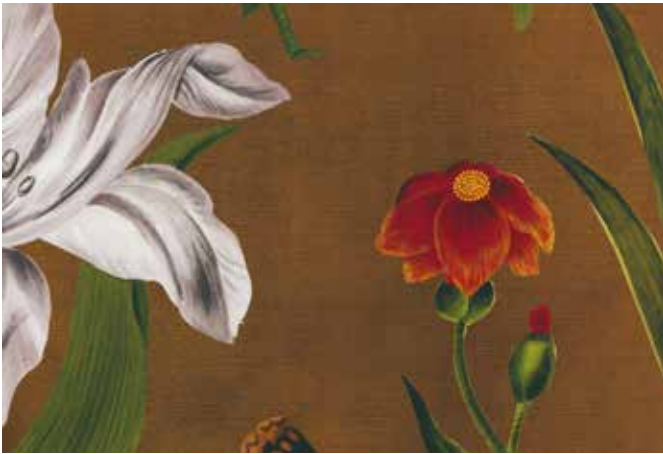
04 Spring Fever in Halcyon on Hand-gilded Paper