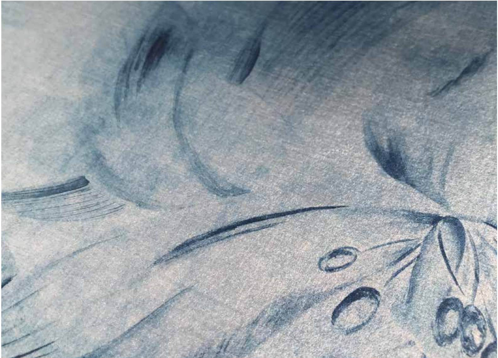
IMAGE Close-up of Spring Fever in Delft Blue