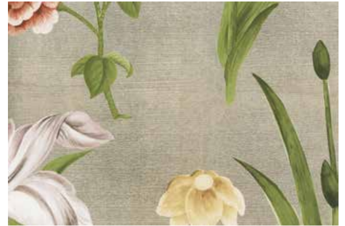
03 Spring Fever in Tulip Leaf on Hand-gilded Paper