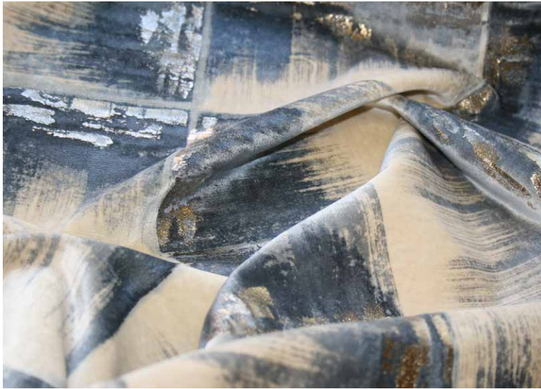
01 Storm Blue