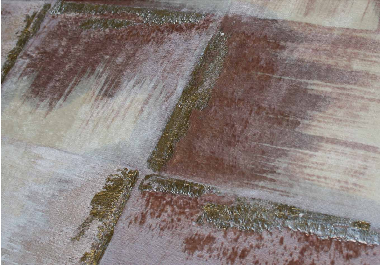
RIGHT-HAND IMAGE Close-up of Ukiyo-e in Puce

“Block” the first design in our ukiyo-e fabric collection, is hand painted and gilded onto fine Italian velvet.