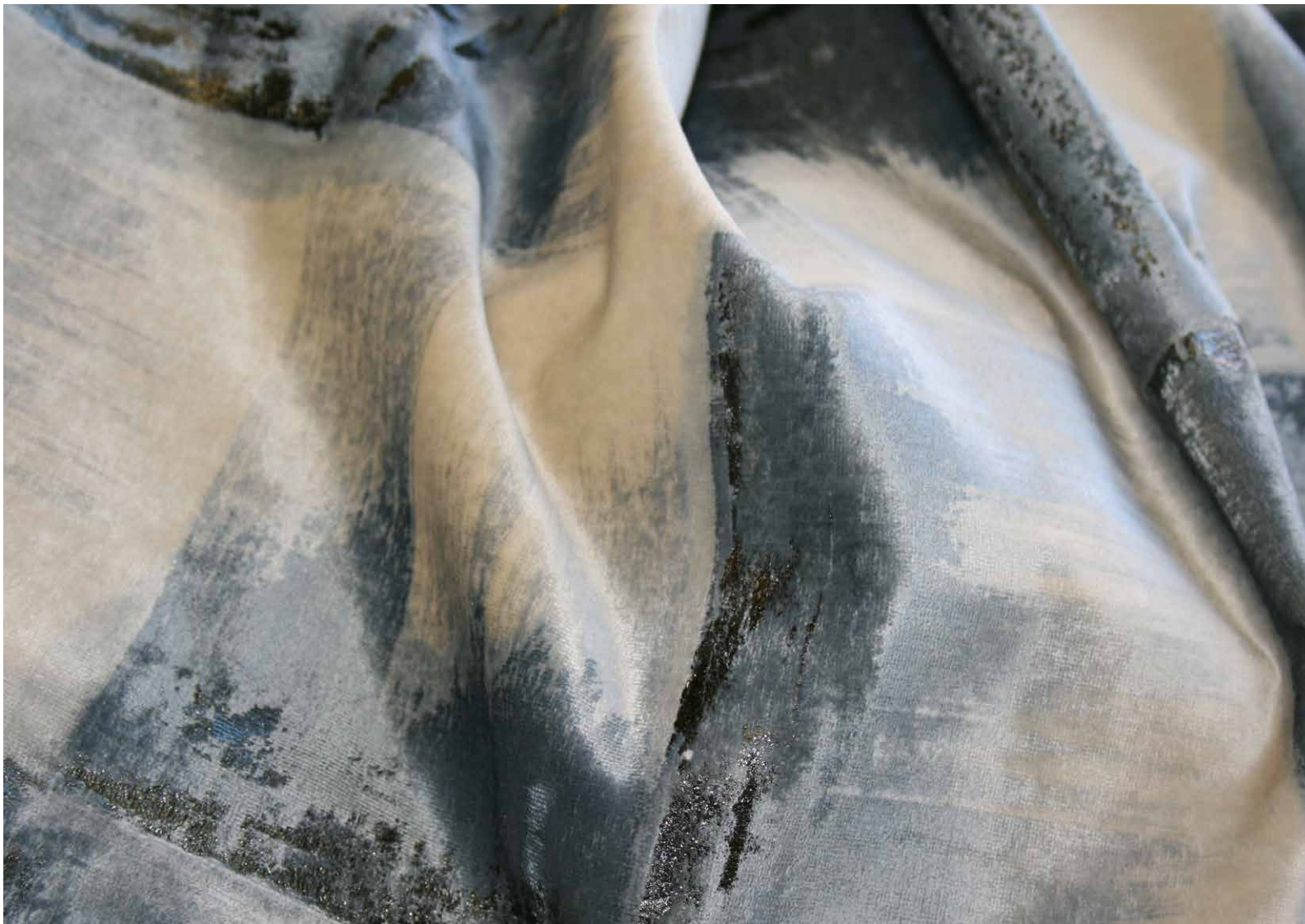
Ukiyo-e in Storm Blue