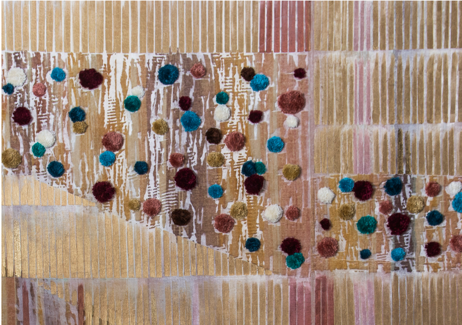
Goldoni in Vienna